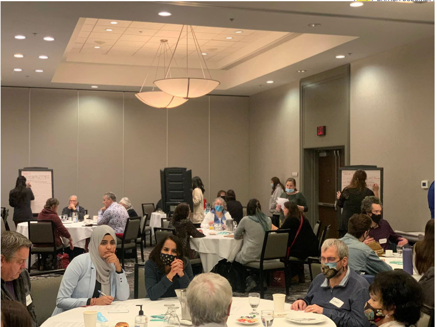
The community dialogue is in full force as participants discuss the first question and MNBC staff members record and report what was talked about.