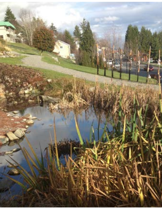
MNAI featuring Gibsons