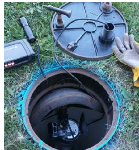
RDOS West Bench Homeowner Leak Detection Program

Approximately 55% of CARIP respondents have organics collection programs in place (an increase of 2% since 2016). Over 80% of medium-sized and large communities operate such programs (an increase of 10% from 2016).