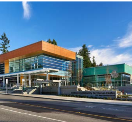
District of North Vancouver

The District of North Vancouver opened their new Delbrook Community Recreation Centre. The innovative design of this community facility includes natural day lighting, energy efficient lighting and an integrated heat recovery system as part of the air-to-water heat pump system for heating and cooling. It also incorporates a high performance building envelope, natural landscaping and water conservation fixtures. The building exceeded the targets set out in the District's green building policy and received incentives through BC Hydro's New Construction Program. More information is available at: http://www.dnv.org/recreation-and-leisure/delbrook-community-recreation-centre .