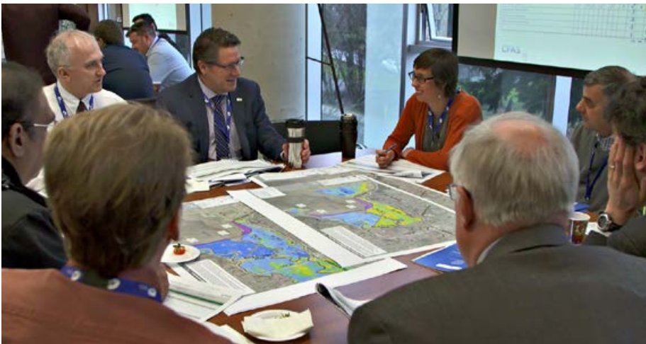
City of Surrey Coastal Flood Adaptation Strategy

Stormwater management strategies seek to improve stormwater drainage thereby reducing the risk of flooding during heavy rain events.