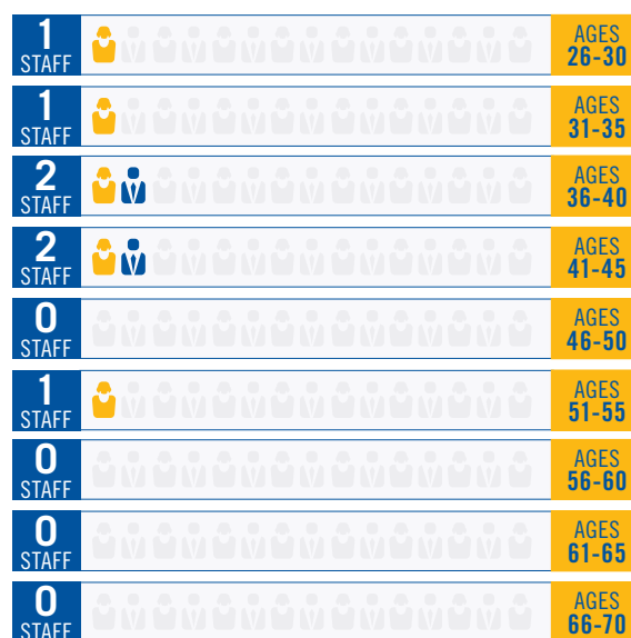
Exhibit 5 – DISTRICT OF TOFINO NUMBER OF EXEMPT EMPLOYEES BY AGE

72. As Exhibit 5 shows, only 13 per cent, or one member, of exempt staff was aged 51 years or older. The average age of exempt employees was 40. As a result, attrition due to retirement should not be a major consideration in the District’s workforce planning.