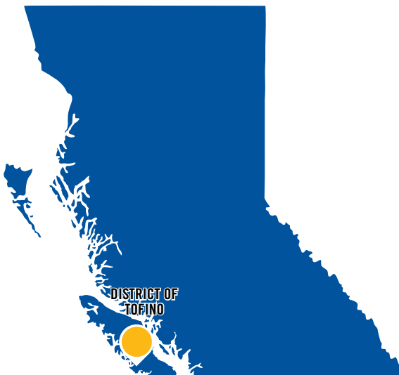
Exhibit 2 - DISTRICT VISUAL FACTS

44. This area has experienced significant change and growth over the past 15 years. It has become an international destination and tourism is now the main economic driver. The natural resource-based sector, formerly focused on fishing and logging, has evolved to focus mainly on aquaculture and sustainable logging.