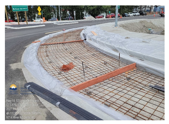
S1: Concrete apron pour. Taken July 16, 2021