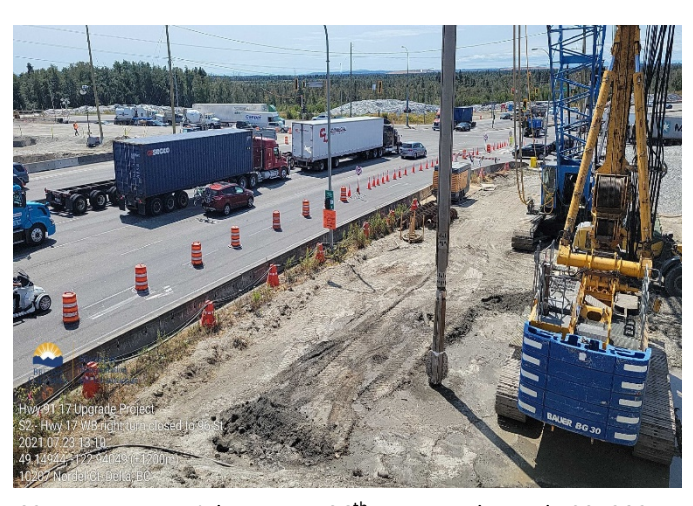
S2: Hwy 17 WB right turn to 96<sup>th</sup> street. Taken July 23, 2021