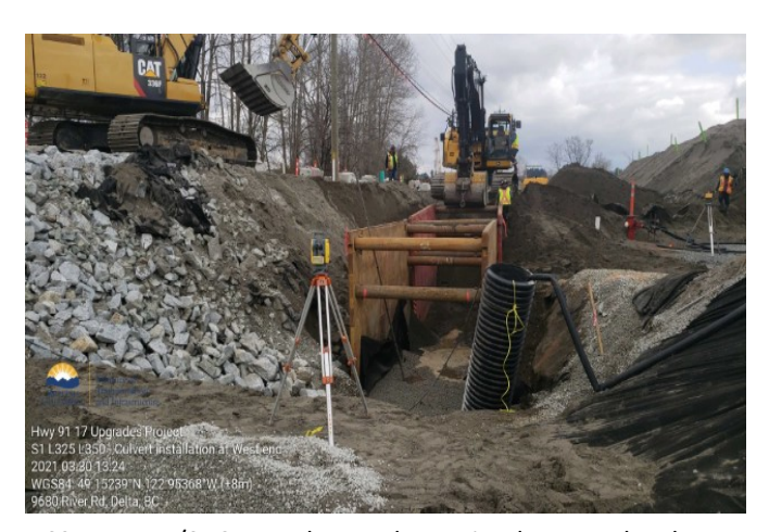
S2: Hwy 17/91C Interchange detour implemented. Taken July 30, 2021