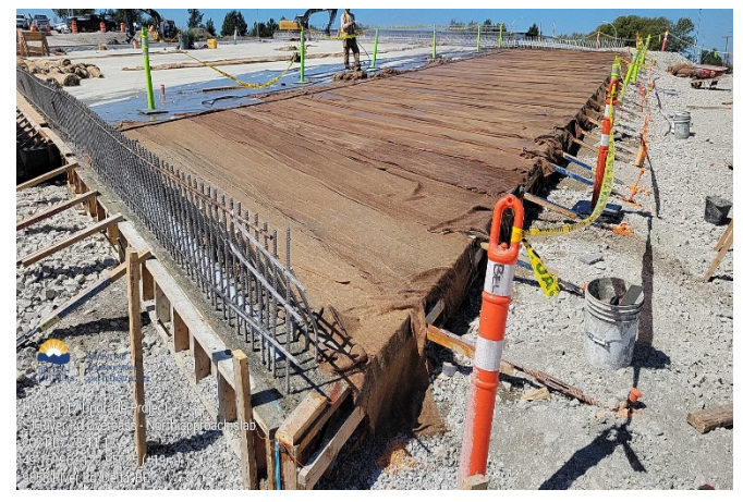
S1: River Road structure North approach slab. Taken July 28, 2021