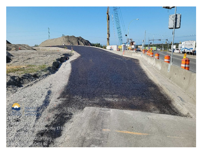
S2: Tie-in with existing Hwy 17 EB. Taken July 5, 2021