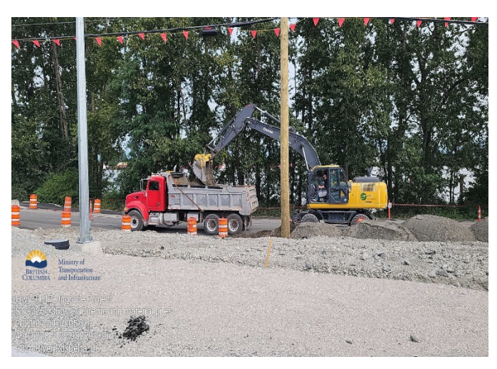
S1: Removing material piles. Taken July 8, 2021