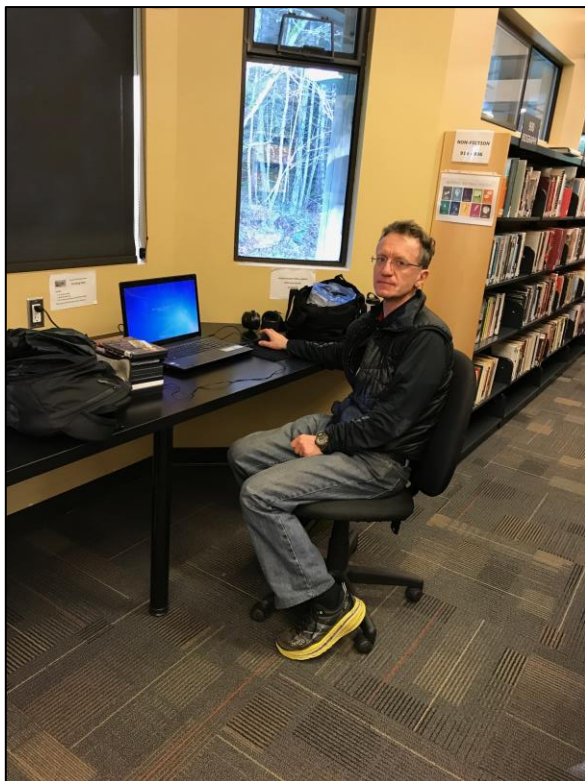
Patron using Wi-fi at laptop work area in the library.