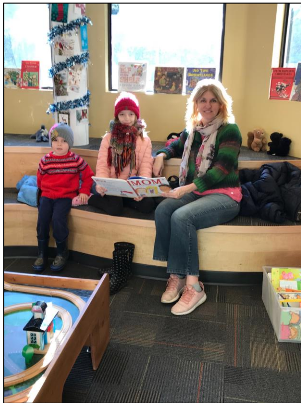
Families enjoy reading in the youth section of the library.