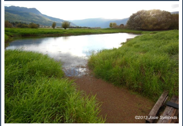
Figure 2 Wet ditch habitat near Salmon Arm, B.C.