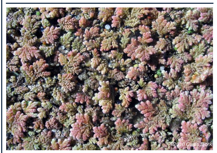
Figure 5 Thick carpet of Azolla mexicana with spore capsules