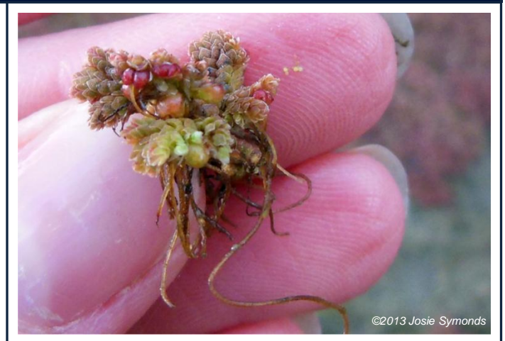
Figure 6 Close-up of single plant with microsporangia visible