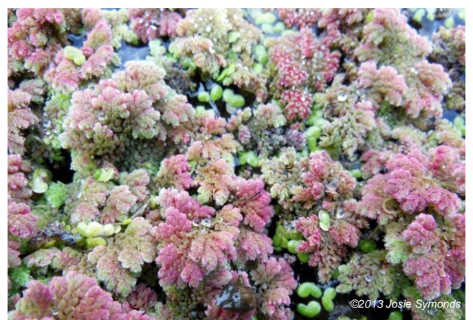
Figure 3 Robust individuals occurring with duckweed