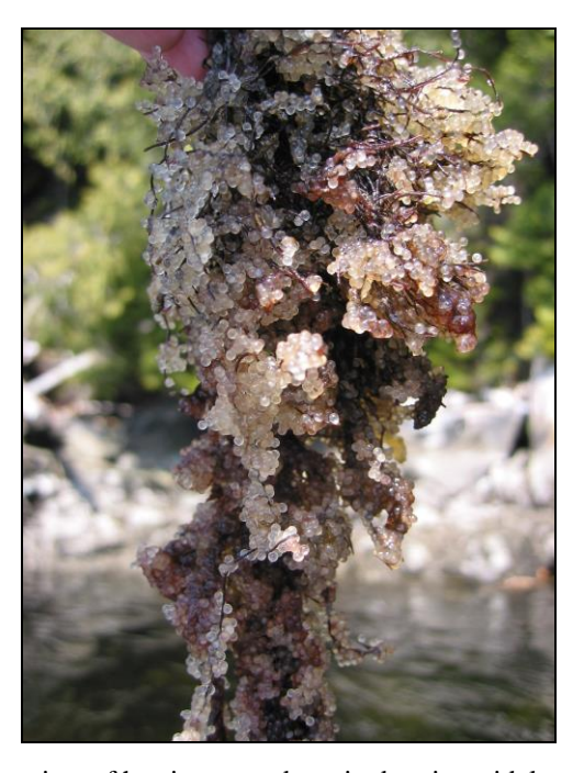
Photo 3: Close up view of herring eggs deposited on intertidal vegetation.