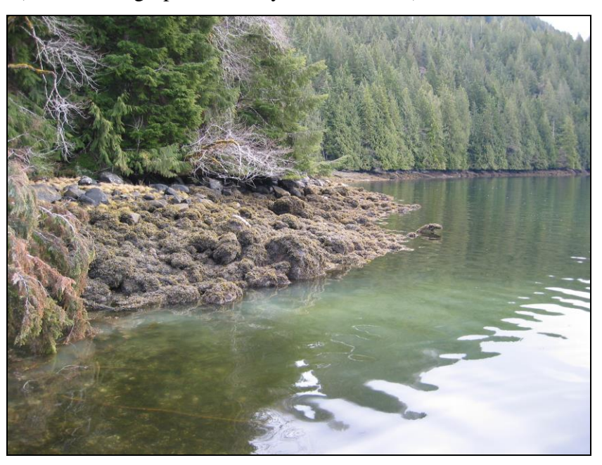
Photo 2: Herring spawn in shallow estuary area as shown by the milky spawn in water and eggs deposited on intertidal algae.

spawn is deposited within 10m of the mean tide level, and >90% occurs within 150m of the inshore edge of spawning. Eggs are deposited on surfaces of vegetation in 1-5 layers on average, with a maximum of 20 layers found (Photo 3). Once deposited, the eggs take about 14 days to hatch in areas in the South Coast, and closer to 21 days in the north, depending on water temperatures (DFO Herring Spawn Survey Manual, 2009).