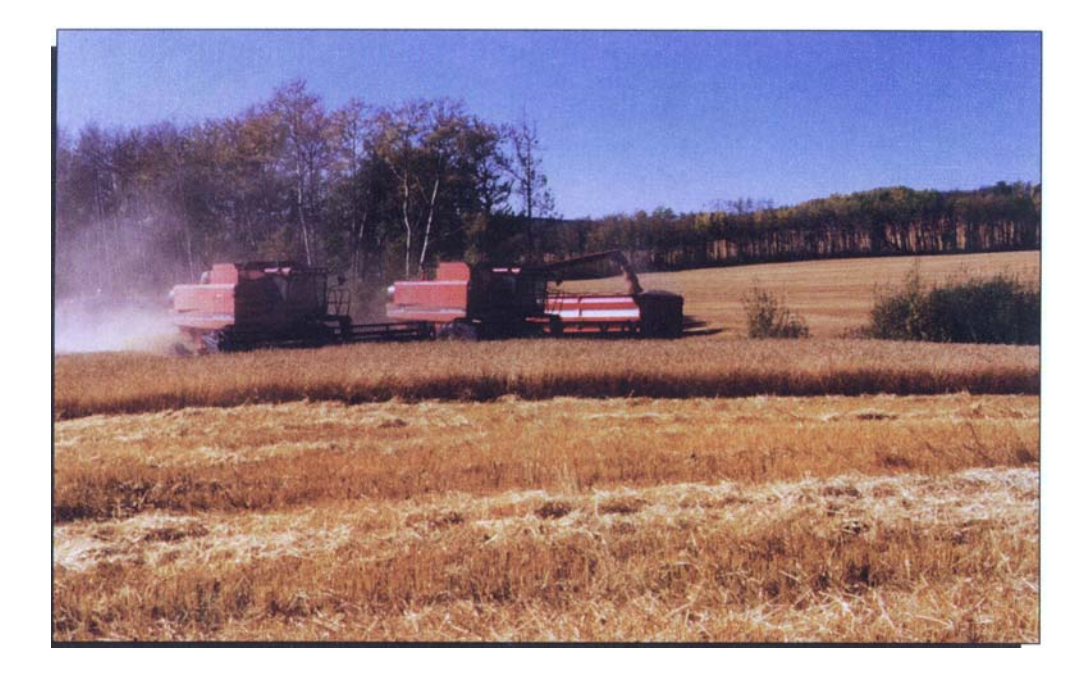
Grain Harvesting in the Peace River Region, British Columbia

Canadian hog production units are becoming larger and new units now coming on stream are 500 to 1,200 sow modules. New farrow to finish operations will have a capital cost of approximately $4,200 per sow with an additional $800 required for breeding stock, feed and facility operations up to the point where the unit will start to produce a cash flow. Financing assistance for the development of hog production units is available from several banking institutions and one federal government crown corporation. Equity requirements will vary between 20 per cent and 50 per cent depending on the lending institution, security offered, management's expertise and the total business plan presented.