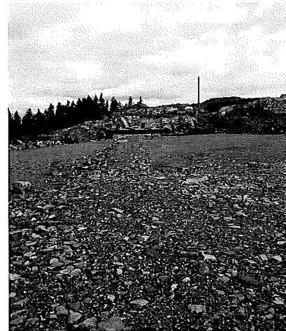
Pipe trenching and Leachate and Leak Detention facility