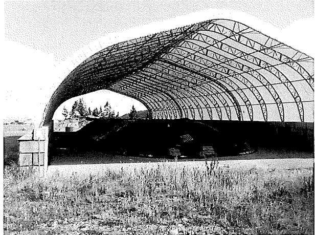
SMA – looking north