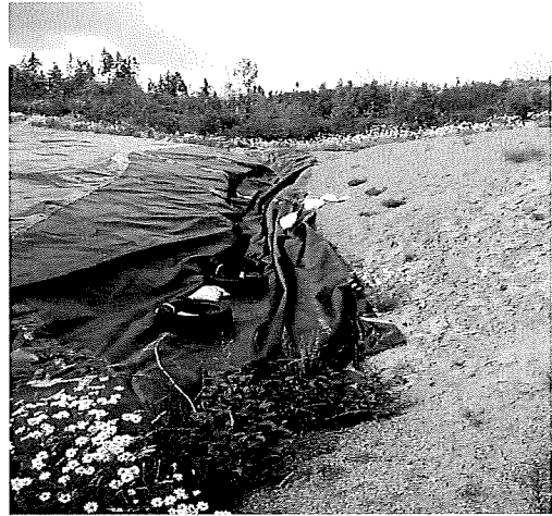
PEA– NW corner