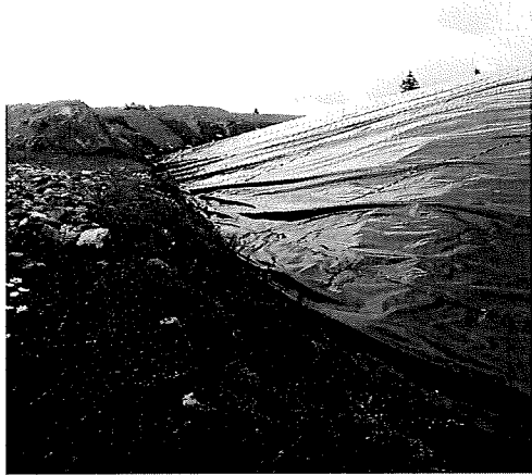
PEA – liner near NE corner