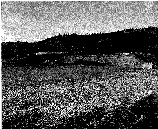
Contact water containment Pond