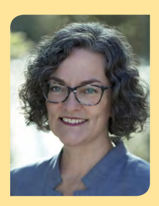
Leanne Dospital is British Columbia's Advocate for Service Quality and was appointed by an Order in Council in April 2016. The Advocate reports directly to the Minister of Social Development and Poverty Reduction.