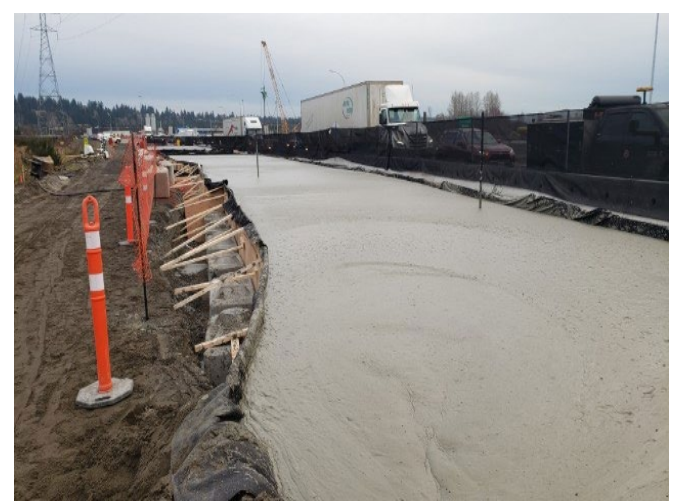
S3 Sunbury - East – Cellular concrete lightweight fill along top of the existing Fortis gas mains. Taken December 3, 2020