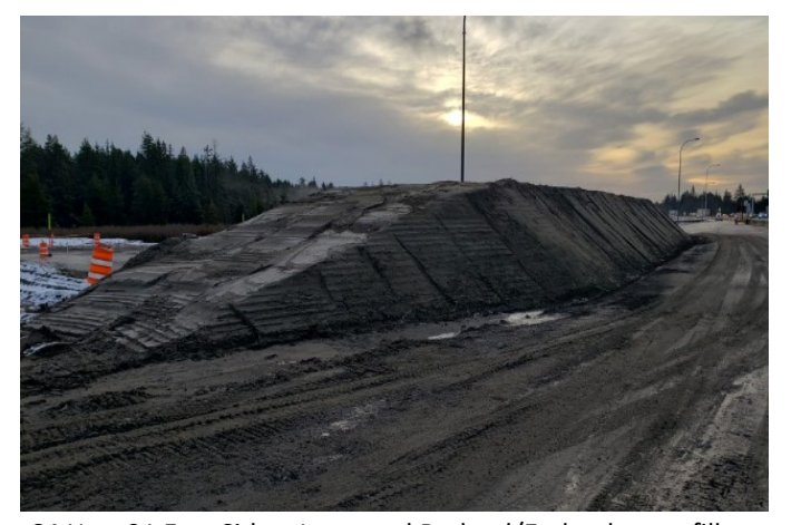
S4 Hwy 91 East Side – Imported Preload/Embankment fill temporary stockpile sloped and sealed. Taken December 23, 2020