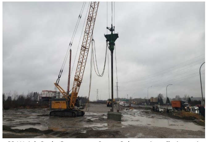
S3 Weigh Scale Overpass – Stone Columns installation using the DBF method. Taken December 18, 2020