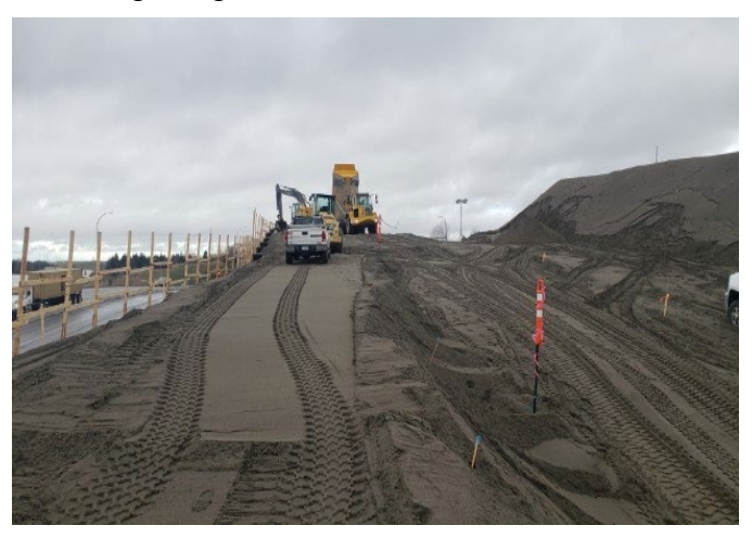
S2 Hwy 91C/17 I/C – Preload/embankment fill placement ongoing. Taken December 15, 2020