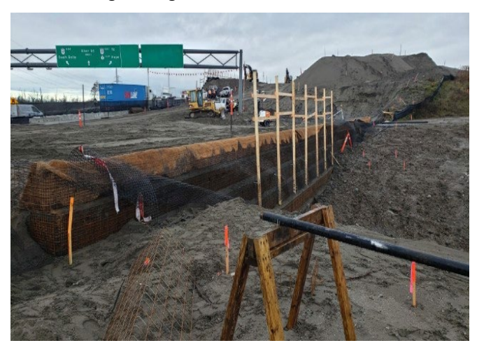
S2 Hwy 91C/17 I/C – Construction of the sloped wall. Taken December 9, 2020