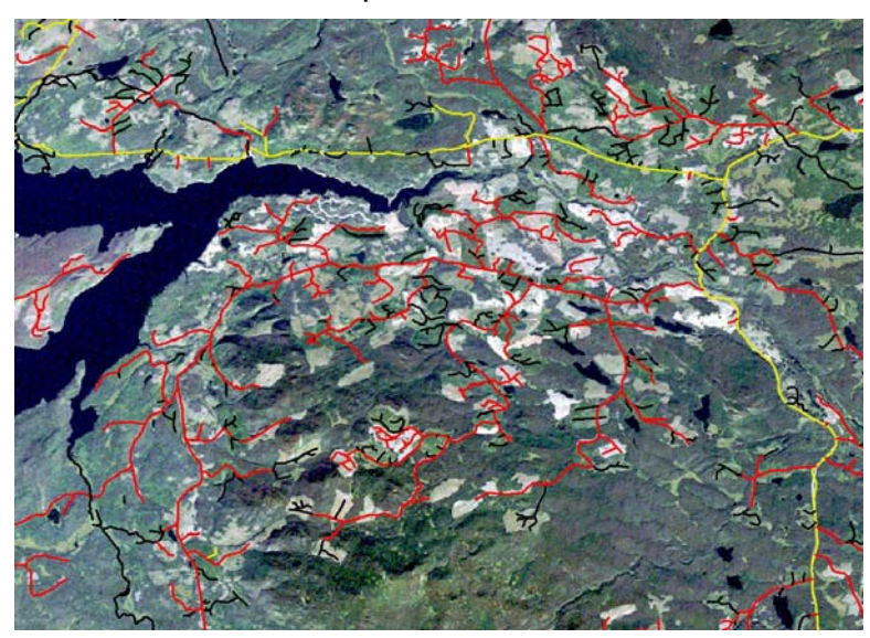
Figure 3: Example of road designations into cutblocks as a means to demonstrate how some in-block roads are included in the road density calculation.

The length of road included in the road density calculation is completely dependant on how much of the road is classified as a "permitted road" in the consolidated road inventory. In some cases, the road is permitted into the cutblock and in other cases it is not (Figure 3).