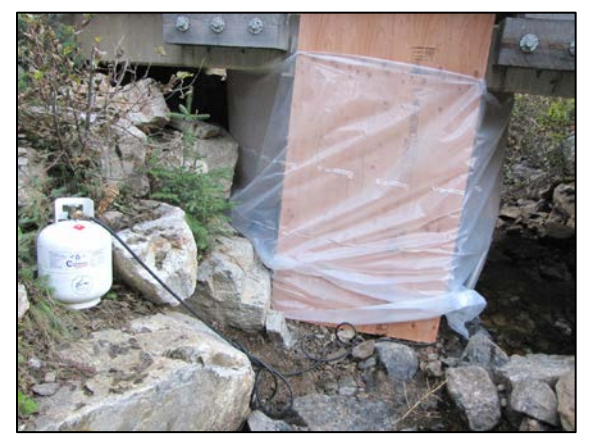
Figure 9: Makeshift tent used with a Tiger Torch to provide heat in cold temperatures to improve grout curing conditions for the repair site. This method is known as 'hoarding'.