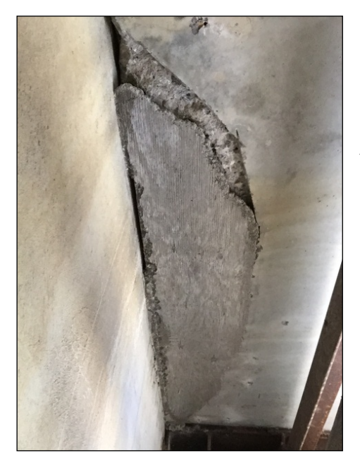
Figure 8: Formwork on underside of deck panel removed showing grout patch inadequately tamped along the edge of the formwork; see Figure 7 for additional repair.