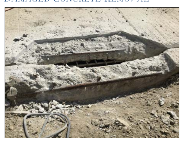
Figure 3: Site preparation in progress – removal of damaged concrete on top of ballast wall and end deck panel. Note saw cut square edges.