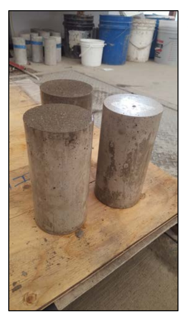
Figure 1: Ministry Standard 2" test cylinders.

Depending on the nature and significance of the repairs, the Engineer may specify taking of grout samples during the repair works to test and confirm for adequate compressive strength prior to placing the repaired components into service.