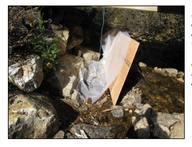
Figure 2: Example of a collection system for containing debris and waste for the work site. This could be improved by using a larger tarp to better ensure all debris is captured.

A preliminary site cleanup shall be undertaken to remove any dirt, dust, organic debris, ponded water, on top of or around the areas to be repaired, that may negatively impact the environment or impede repairs.