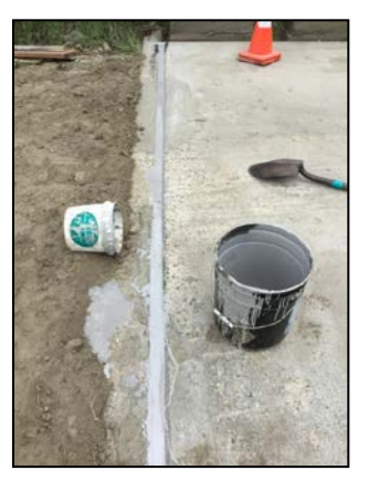
Figure 12: Paraseal sealant placed at gap between ballast wall and concrete deck subsequent to concrete repair works.

If the repair is beside the ballast wall, place foam at the bottom of the gap between the ballast wall and deck panel and place Paraseal level with the top of deck panel and ballast wall (Figure 12)