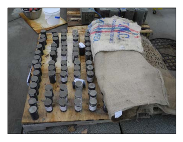
Figure 10: Example of damp burlap sacks being used to keep grout sample cylinders cool and moist.