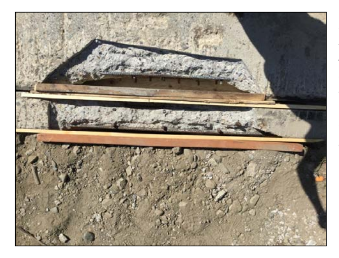
Figure 7: Formwork placed, subsequent to removal of damaged concrete, to contain grout for ballast wall and deck panel repair.

When temperatures exceed 25°C, saturate the forms in addition to saturating the surface of concrete. Allow the concrete to reach the surface dry condition. By saturating the form the concrete is prevented from drying too quickly which in turn can result in the concrete cracking.