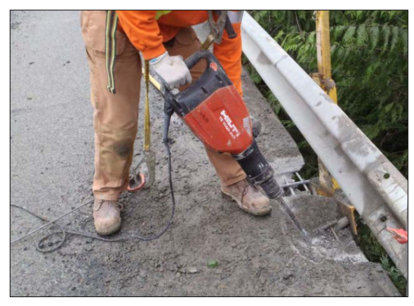
Figure 4: Mechanical removal of damaged concrete with a chipping hammer