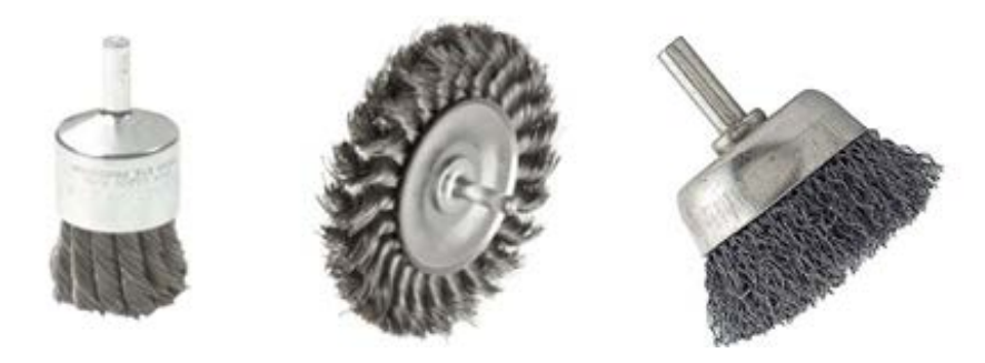
Figure 6: Wire Brushes. Left to right: a) Knotted b) Partial-knotted c) Crimped

Knotted (Figure 6a) or partial-knotted (Figure 6b) wire brushes are recommended for heavy rust removal. A crimped-wire brush (Figure 6c) may be used for moderate to low rust removal.