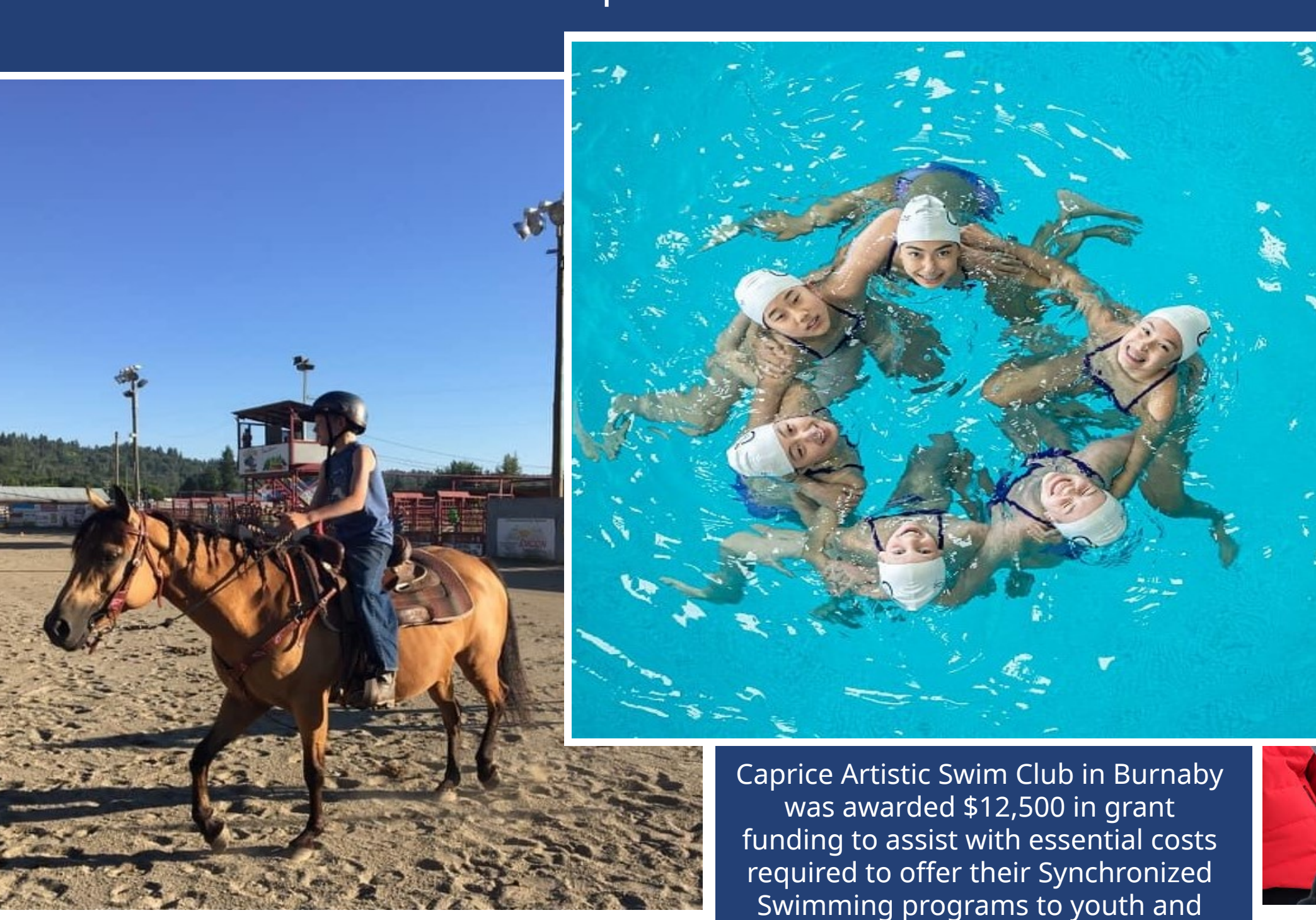
North Cariboo Gymkhana Society in Quesnel received $2,500 in grant funding to assist with arena rental, equipment repair, wages, and other costs essential to run their Gymkhana program.

7% Of organizations funded had programs targeted toward supporting Indigenous British Columbians