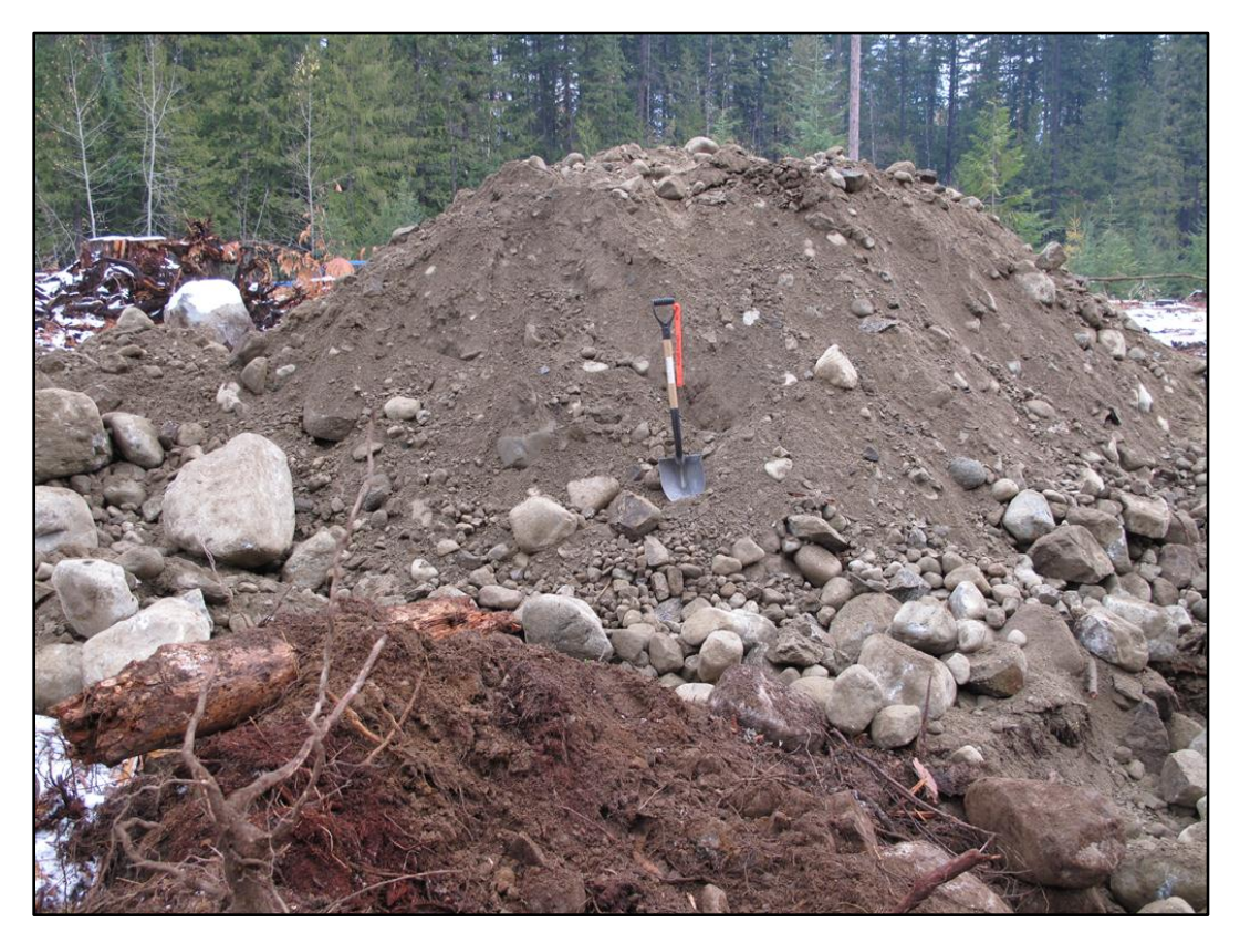
Test Pit 11-31 material