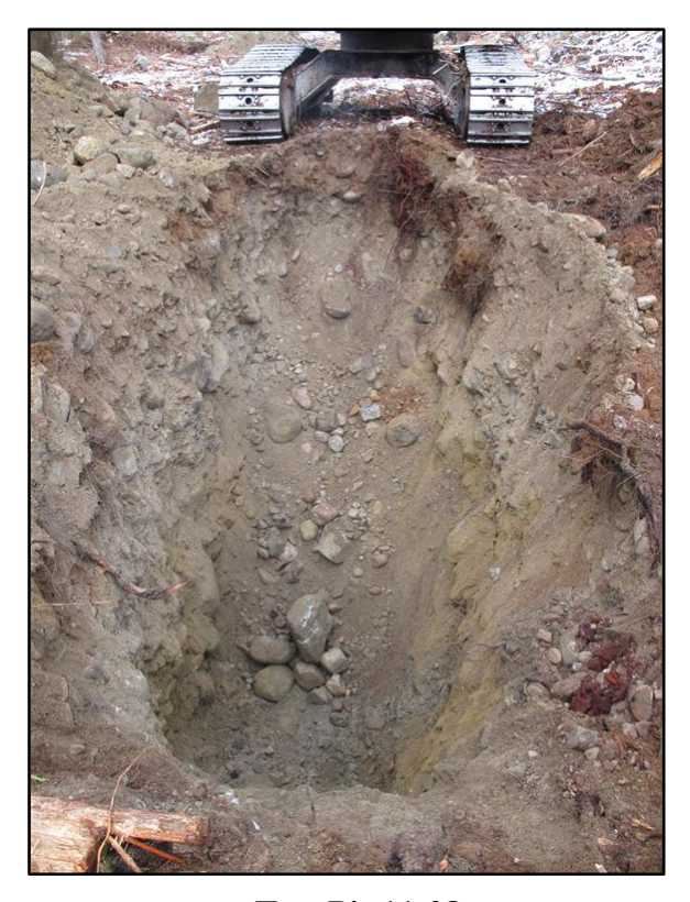
Test Pit 11-28