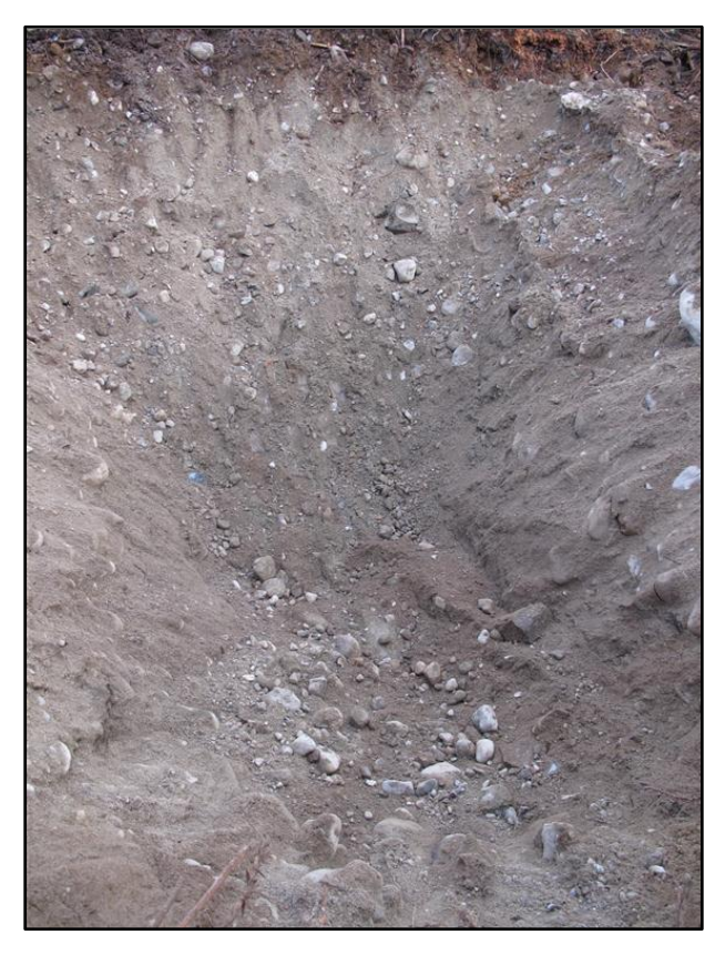
Test Pit 11-11