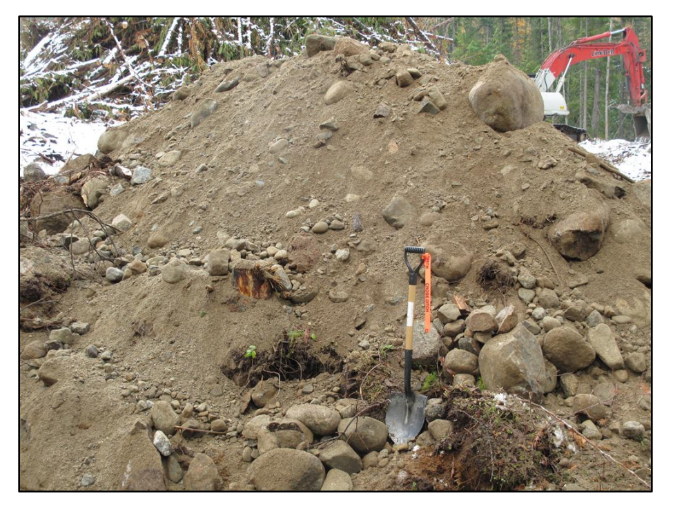
Test Pit 11-25 material