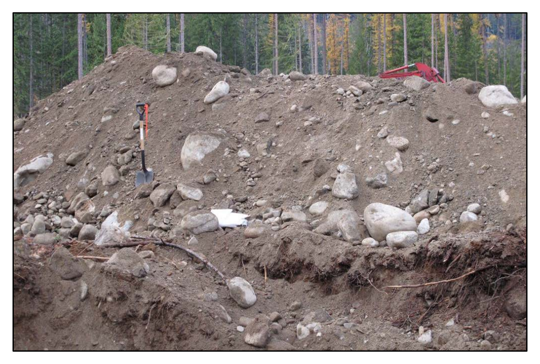
Test Pit 11-11 material