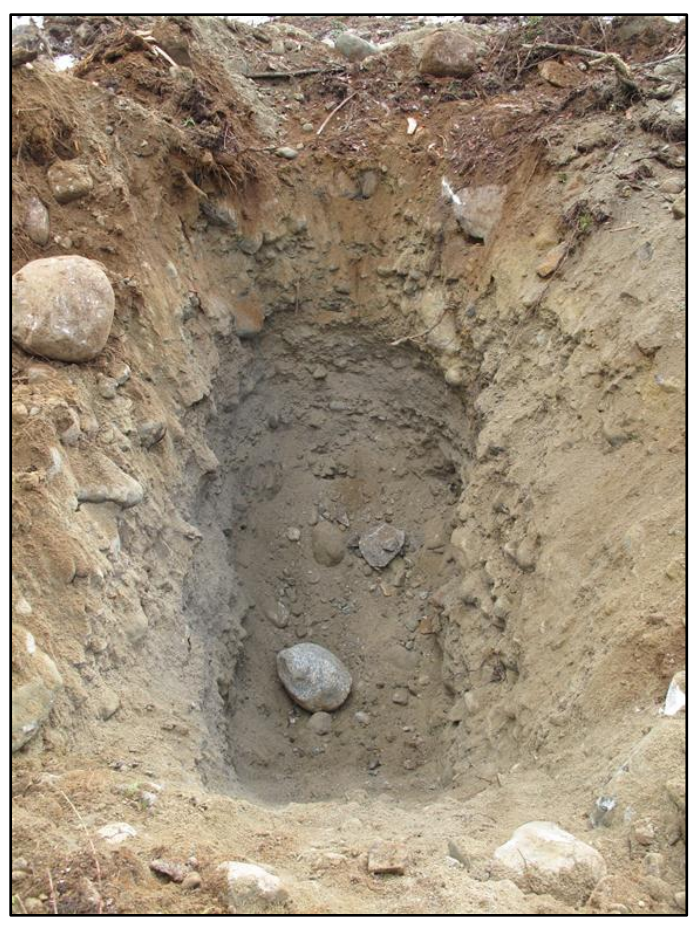
Test Pit 11-25