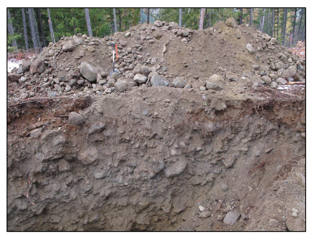
Test Pit 11-28 material