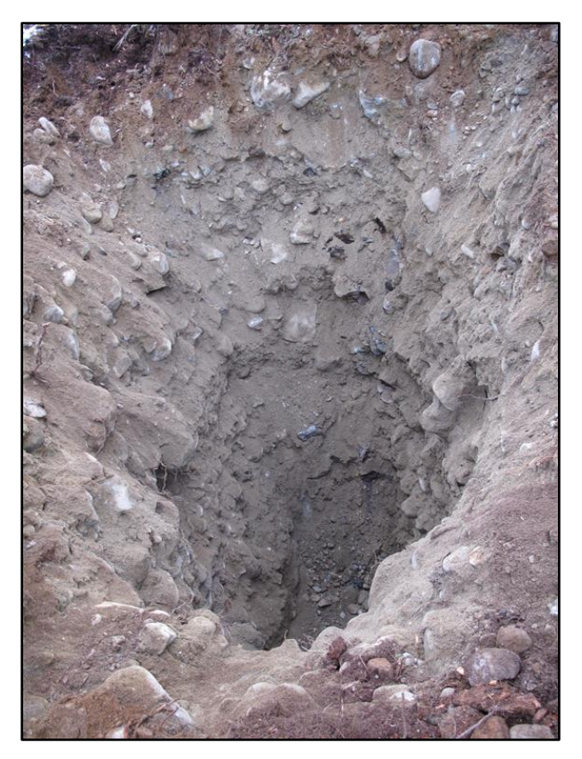
Test Pit 11-31