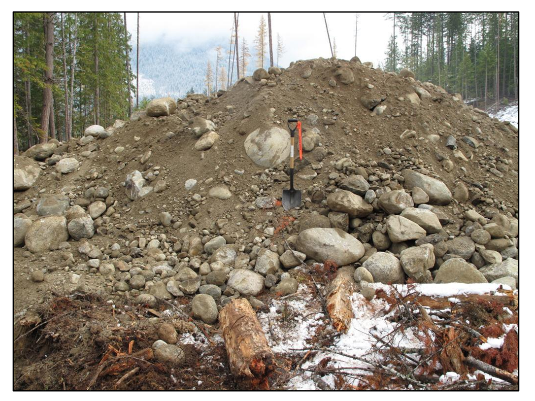
Test Pit 11-23 material