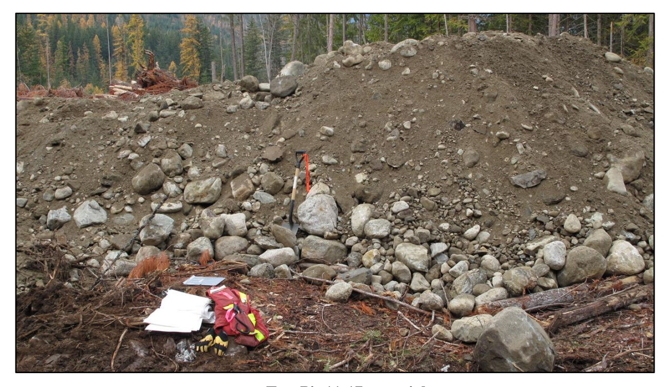
Test Pit 11-17 material