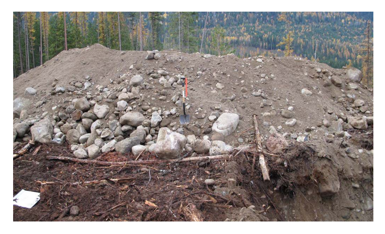
Test Pit 11-08 material