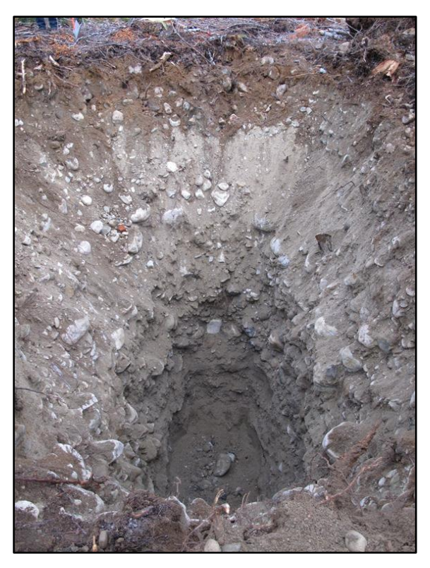
Test Pit 11-08