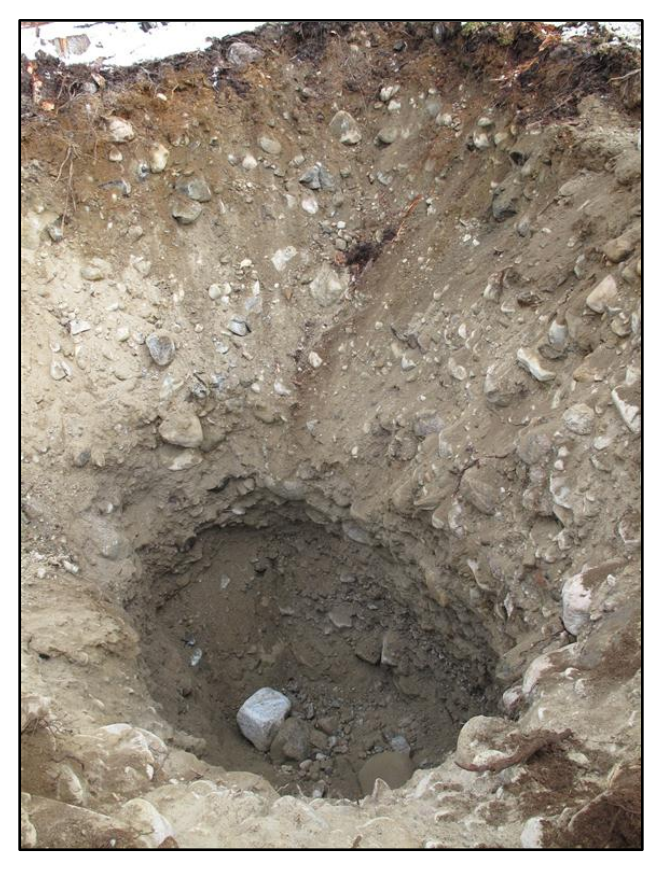
Test Pit 11-23