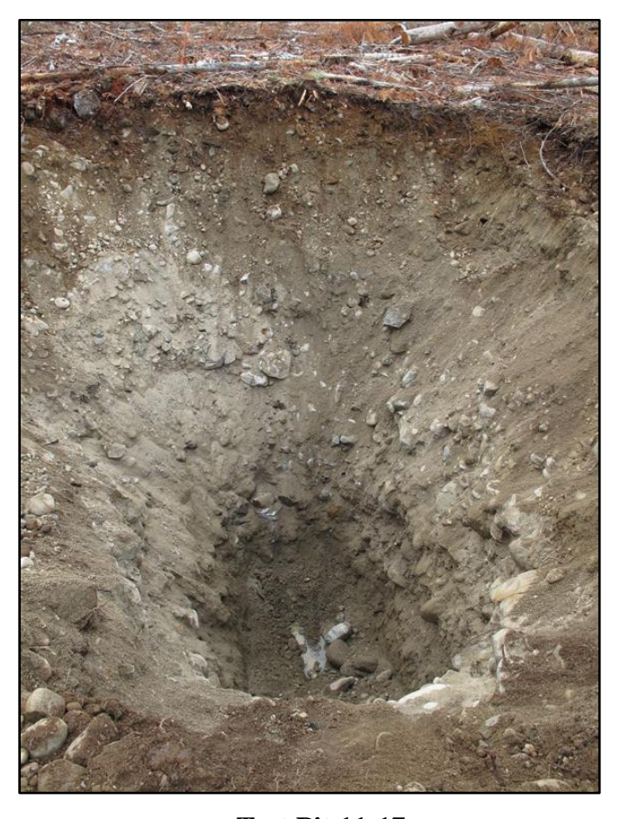
Test Pit 11-17