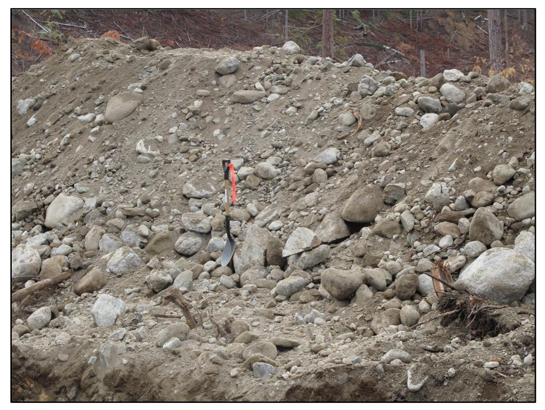
Test Pit 11-13 material