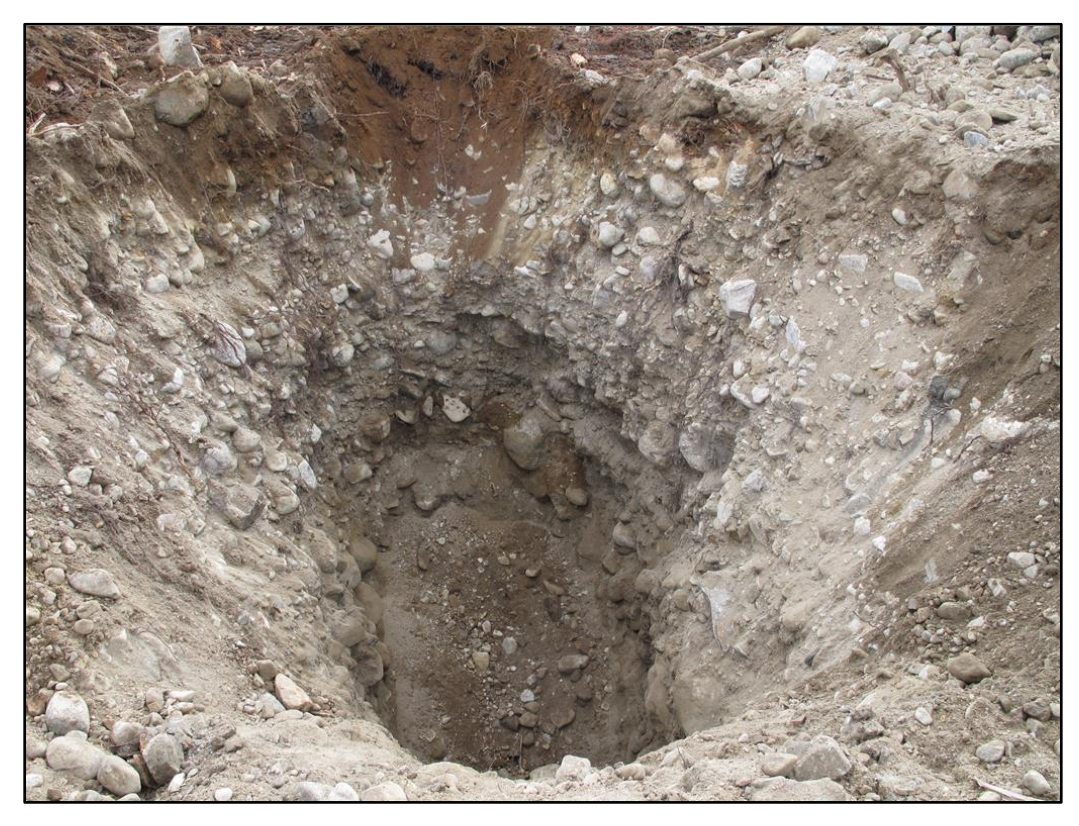
Test Pit 11-13