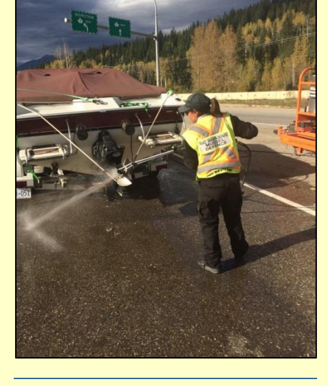
82% of the mussel fouled boats intercepted to date have come from Ontario

The Program is working with the Province of Alberta to raise awareness of Whirling Disease outbreak in Banff National Park. Please stay tuned for further updates.