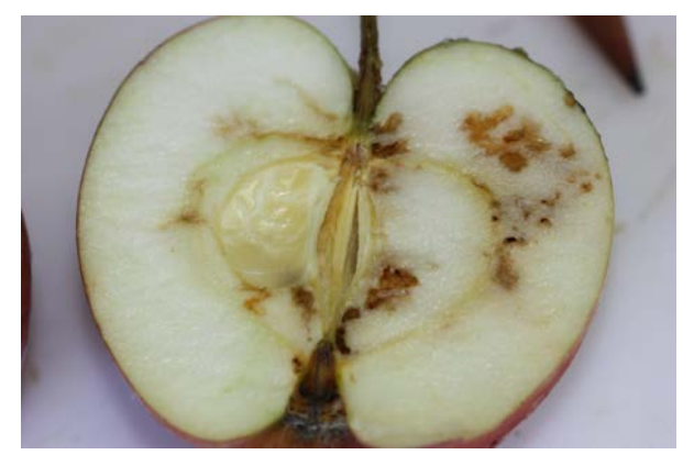
Internal feeding damage by apple maggot.

Please contact the CFIA at (604) 557-4500 if you plan to move any host fruit, host trees with soil, or host nursery stock, out of the Lower Mainland, Vancouver Island or Prince George areas.