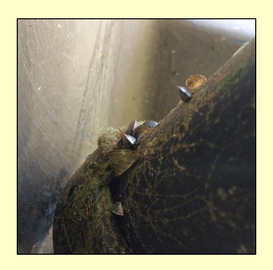
To date, 9 mussel infested boats have been intercepted