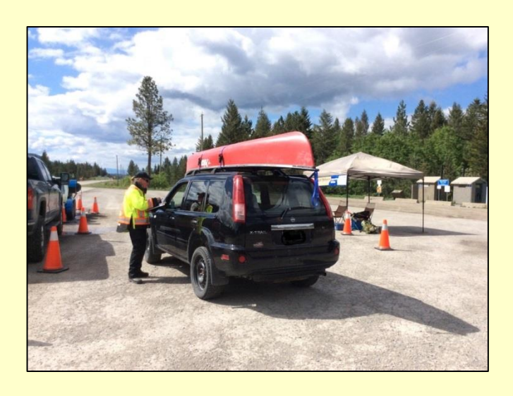
A total of 36 tickets and 29 warnings have been issued to motorists for failing to stop at an inspection station

To date a total of 36 tickets and 27 warnings have been issued to motorists for failing to stop at a watercraft inspection station.