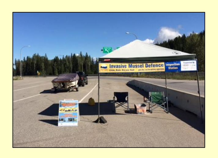
Watercraft inspected to date have been identified as traveling into B.C. from 55 different provinces, territories and states

August 20th and 27th Cabelas' outreach events