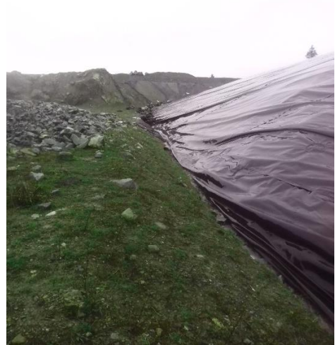
PEA– NE corner