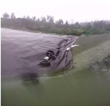
PEA – liner near NW corner