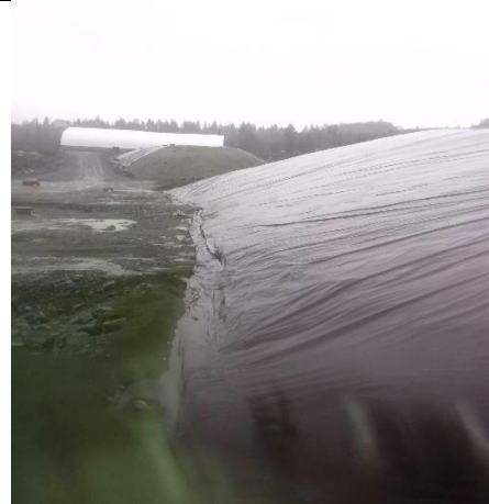
PEA north face