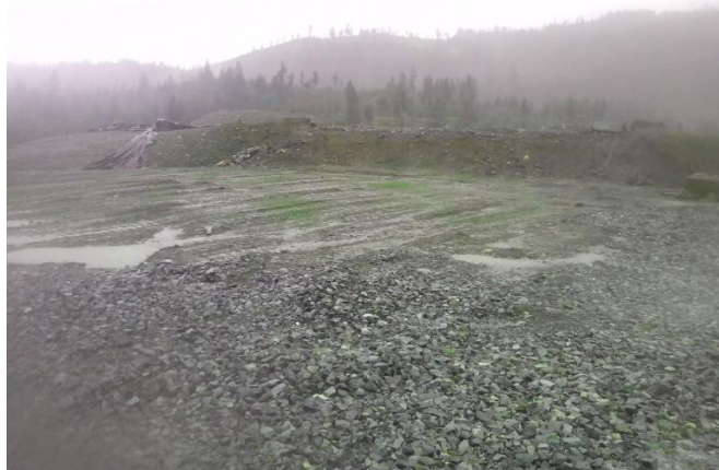
Contact water containment Pond