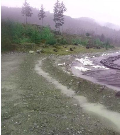
Cut-off ditch upland of PEA