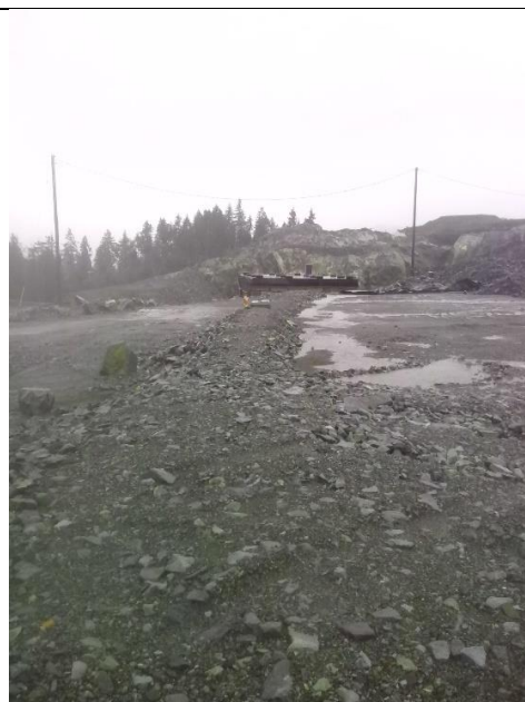
Pipe trenching and Leachate and Leak Detention facility