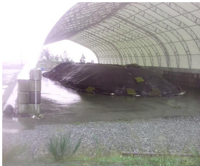
SMA – looking north