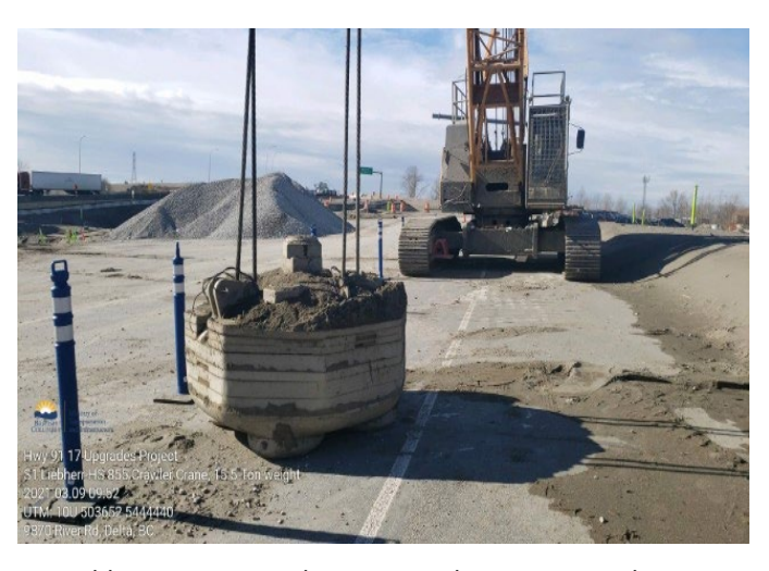
S1: Liebher HS 855 Crawler Crane and 15.5 Ton weight. Taken March 8, 2021