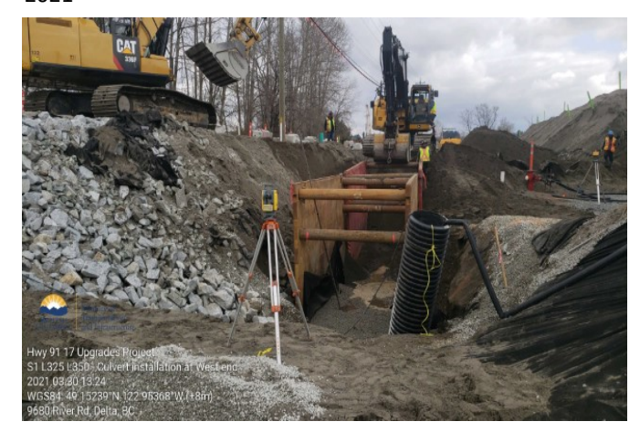
S1: Hwy 17 west culvert installation at West end. Taken March 25, 2021