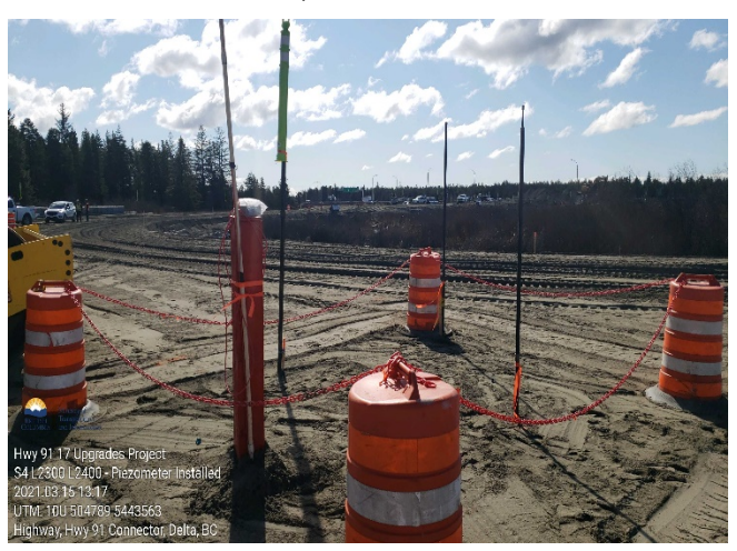
S4: Hwy 91 east side piezometer installation. Taken March 15, 2021