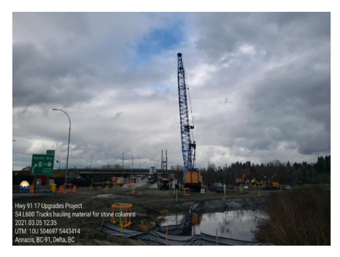
S4: Hwy 91 east side trucks hauling material for stone columns. Taken March 5, 2021