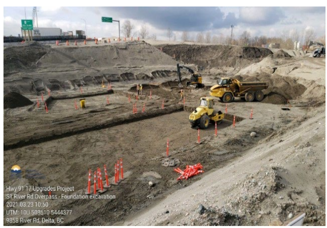
S1: River Road Overpass foundation excavation. Taken March 23, 2021