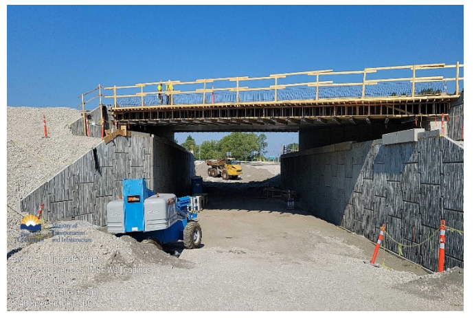
S1: River Road structure - MSE Wall copings. Taken June 29, 2021