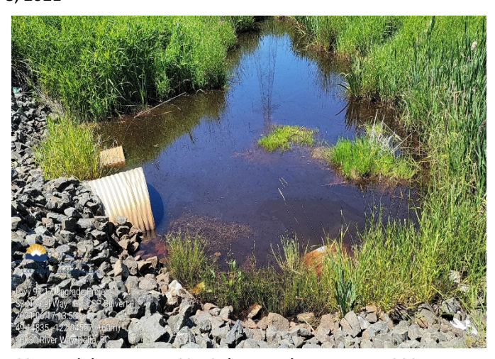
S3: Nordel Way - Ex. CSP Culvert. Taken June 17, 2021