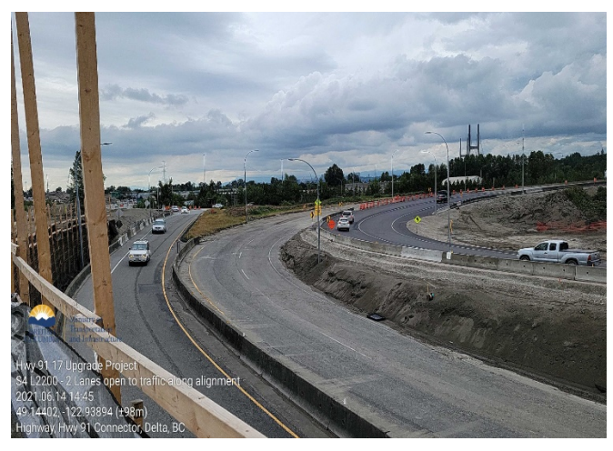
S4: Hwy 91 West Side - 2 lanes open to traffic along alignment. Taken June 14, 2021