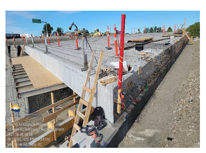
S1: River Road Structure - North Alignment. Taken June 8, 2021