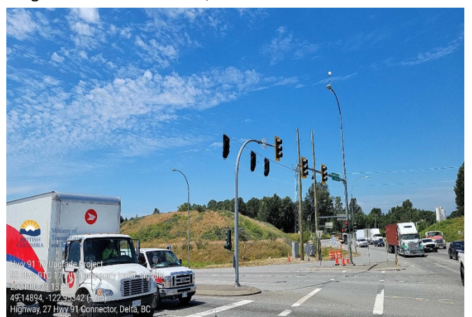
S2: Hwy 91C 17 Interchange - Temporary traffic signals. Taken June 23, 2021