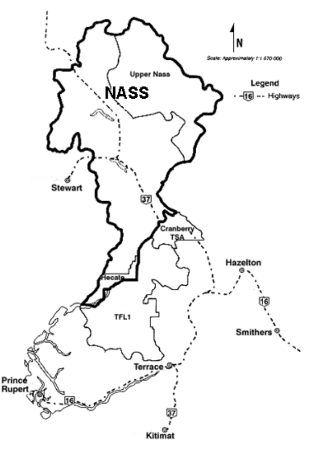
Figure 2. Overview map of the Nass TSA.<sup>7</sup>

Approximately 39% of the Nass TSA land base is considered productive forest land managed by the Crown (approximately 639,000ha). Currently about 30% of the productive Crown forest land is considered available for harvesting (12% of the TSA land base).