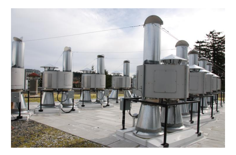
Victoria Regional Laundry – Dryer Heat Recovery Project $210,000 – Custom Retrofit Program Incentive