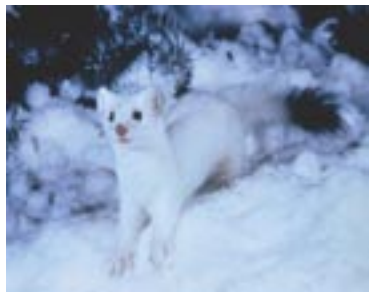
2.) Winter ermine.