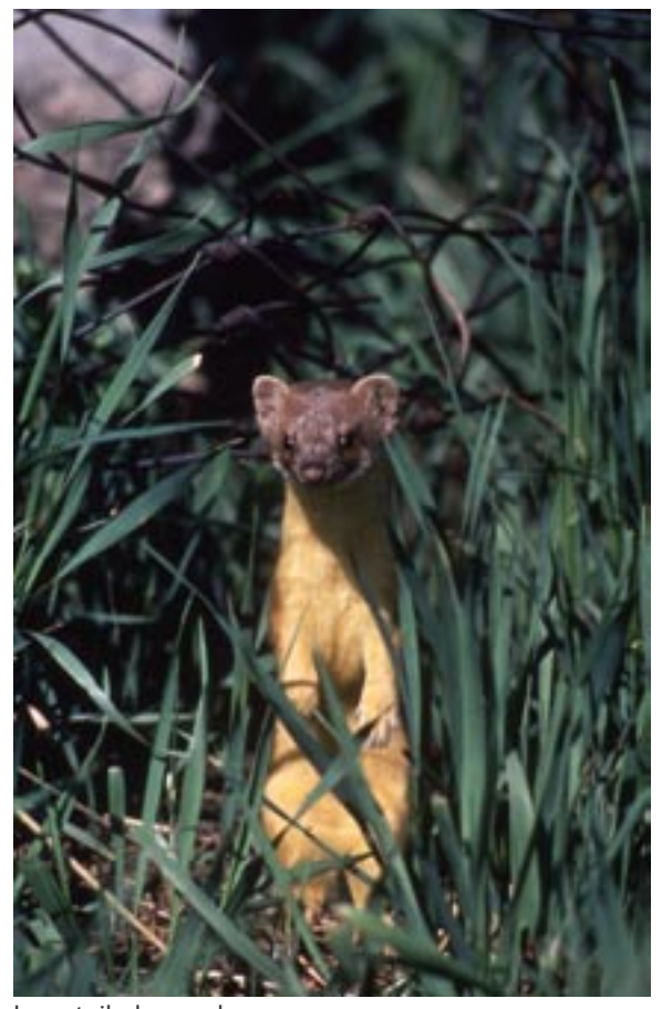
Long-tailed weasel, summer.

The extent of daily movements by resident weasels depends upon the abundance and distribution of prey within their home ranges, but is often less than 500 m from the home den for all three species. Within that space, the actual distance covered may be much larger; one ermine trail in the snow covered 8 km. The