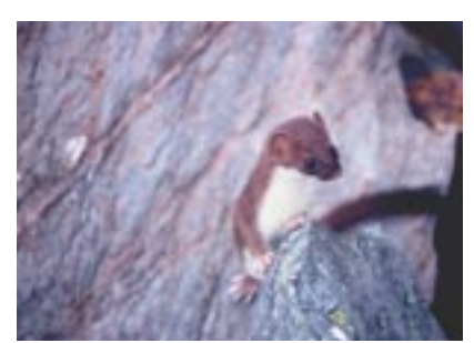
1.) Summer ermine.

Weasels are the smallest North American carnivores. There are three species, and all occur in British Columbia. All have the typical long, thin mustelid (weasel family) shape, with short legs, long neck, and short, dense fur, and most change colour from brown back and white or yellowish belly in summer to predominately white in winter. In areas where winter snow does not normally accumulate, such as the lower Fraser Valley, the change to white may not occur or may be incomplete. Some identification features for the three species are given below. The measurements and weights given are for adults (at least one year old). Juveniles in their first winter may be near full-size in terms of length but are usually lighter in weight, particularly in the case of males.