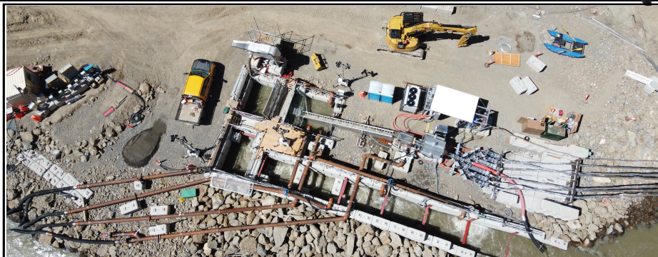
PICTURED: Fish Ladder from the top down.