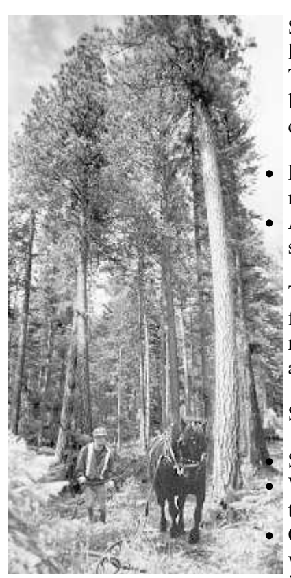
Figure 2. Partial cutting using horses in WADF.

Stand-level management practices and prescriptions are guided by landscapelevel objectives for WADF, including the need to protect other forest values. They will accommodate, to the greatest degree possible, the design unit and landscape pattern objective recommendations developed in the TRD. The objectives of stand-level management are to: