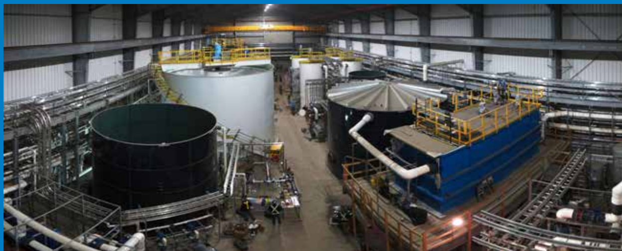
A photo of the West Line Creek water treatment facility in Fall 2013.

The West Line Creek Facility will treat 7,500 m 3 of water every day, enough water to fill three Olympic-sized swimming pools. Planned facility expansions will increase treatment capacity to 15,000 m 3 of water per day. The total quantity of selenium removed in the first phase of the facility is anticipated to be 1.8 kilograms per day, increasing to 3.0 kilograms in the second phase.