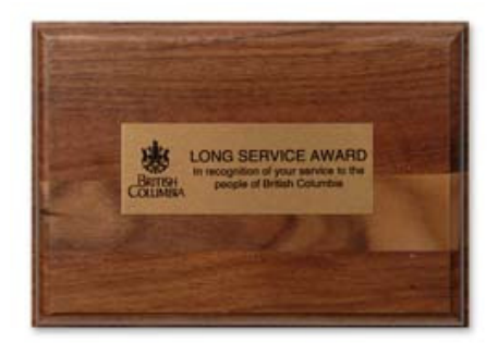
Long Service Award Plaques

Remember to also order 5, 10, 15, 20, 25, 30, 35, 40 year service pins.