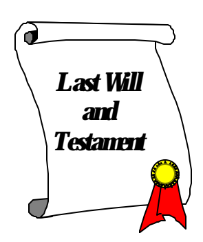
What is a will?

One of the most important documents you execute during your lifetime is your will. Ideally, it's just one of the key elements in your overall estate plan but in some situations it represents the only estate planning that is done. It may have far-reaching effects on your family and business partners so it should be given a lot of thought. A solicitor should always prepare the document in order to avoid potential problems.