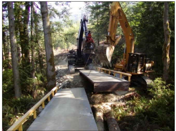
Special attention is always required when working near streams.

Sediment management must be considered during all phases of a road’s life, from location and design to construction, maintenance and deactivation. Special care is required adjacent to streams when locating, designing and installing bridges. Bridge approaches should be designed to effectively intercept ditch water before it reaches a creek, bridge decks should be placed above road grade so water flows away from the bridge, and any unconsolidated material exposed during excavation carefully armoured to limit surface erosion.