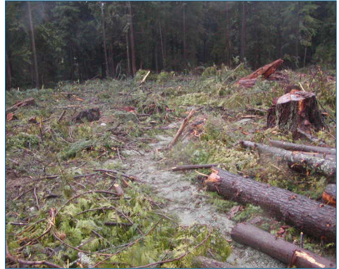
At this location, the forest floor filters sediment laden ditch water (connectivity = 0).

A site might have exposed mineral soil, but does it contaminate waters flowing in natural drainages?