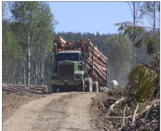
A 3 per cent sloping, moderately used haul road with average surfacing material loses an estimated 2mm of fine sediment each year.

The FREP Water Quality Protocol uses a series of tables to help evaluators choose appropriate values to estimate total volumes of sediment generated. As an example, Table 2 provides estimates of expected fine sediment generation from road surfaces under different conditions.