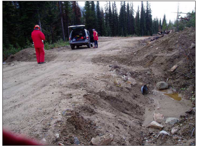
An evaluator assesses how management has affected fine sediment delivery to nearby stream.

Following a site assessment, the evaluator identifies if opportunities are available to reduce potential water quality impacts for sites that scored a “Moderate,” “High” or “Very High” ranking. How a road is located, constructed, and maintained, how a cutblock is harvested, and how a pasture is grazed will determine if and how much water quality may be affected. Placing culverts properly, crowning roads, employing ditch blocks and diversion culverts, using better quality surfacing materials, ensuring wind-firm riparian zones, and controlling livestock access to streams all strongly influence how water quality might be affected. These opportunities for improvement can be used for both mitigating site impacts and as guidance to improve future practices.