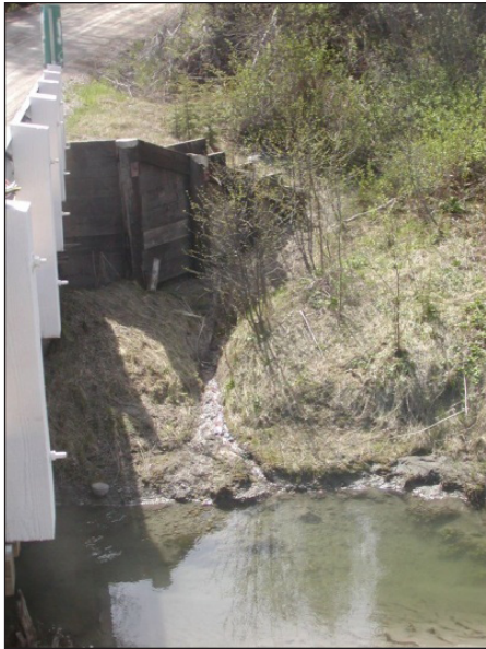
A ditch line drains directly into a stream (connectivity = 1).

Sites not “connected” require no further assessment. Simple tables that help evaluators determine degree of connectivity, (See Table 1), have been provided. Connectivity is primarily dependent on the size of the drainage catchment and distance over the forest floor between discharge and stream.