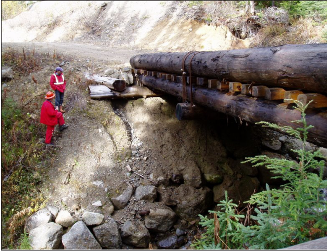
Forest roads near streams can be a major source of fine sediment. At this site a road ditch flows unimpeded over an unarmoured bridge abutment directly into a stream.

results and/or strategies. These evaluations assess outcomes of operational plans to determine the extent to which objectives have been achieved. Recommendations on practices, legislation and policies are provided as they become available.