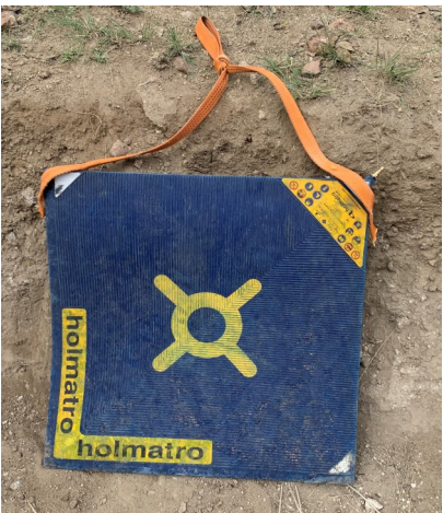
Rubberized air bag. Size: approximately o.6 metre by o.6 metres.

• The rock scalers remove loose rock through manual manipulation using a pry bar. Rock scalers are assisted by helicopters that drop water to sluice loose debris. On larger rocks, rubberized air bags, as pictured right, are placed between rock joints and inflated with compressed air to dislodge unstable the rock.