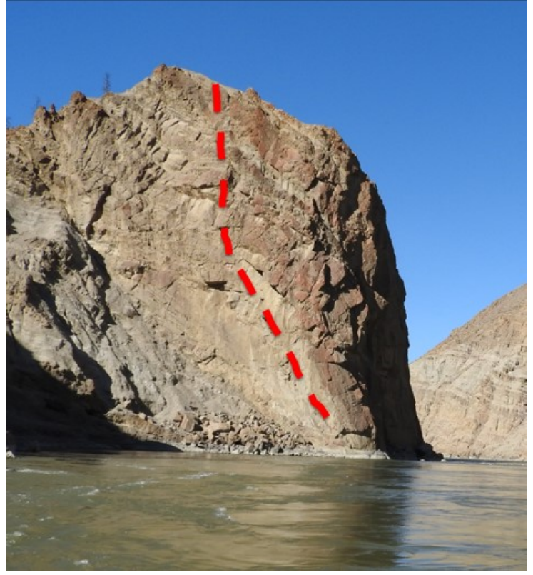
The rock prior to slide.