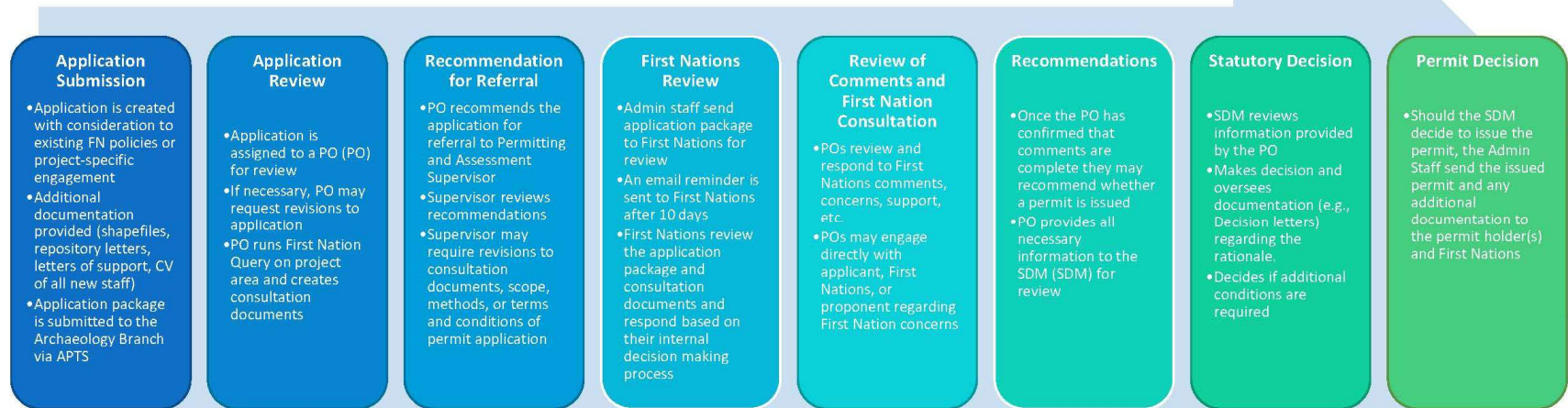
Figure 2. HCA Permit Decision Process for permits issued by the Archaeology Branch