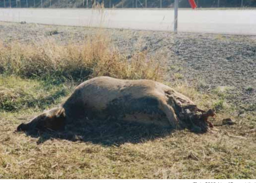
Wildlife Roadkill Identification Guide - 2008 Edition