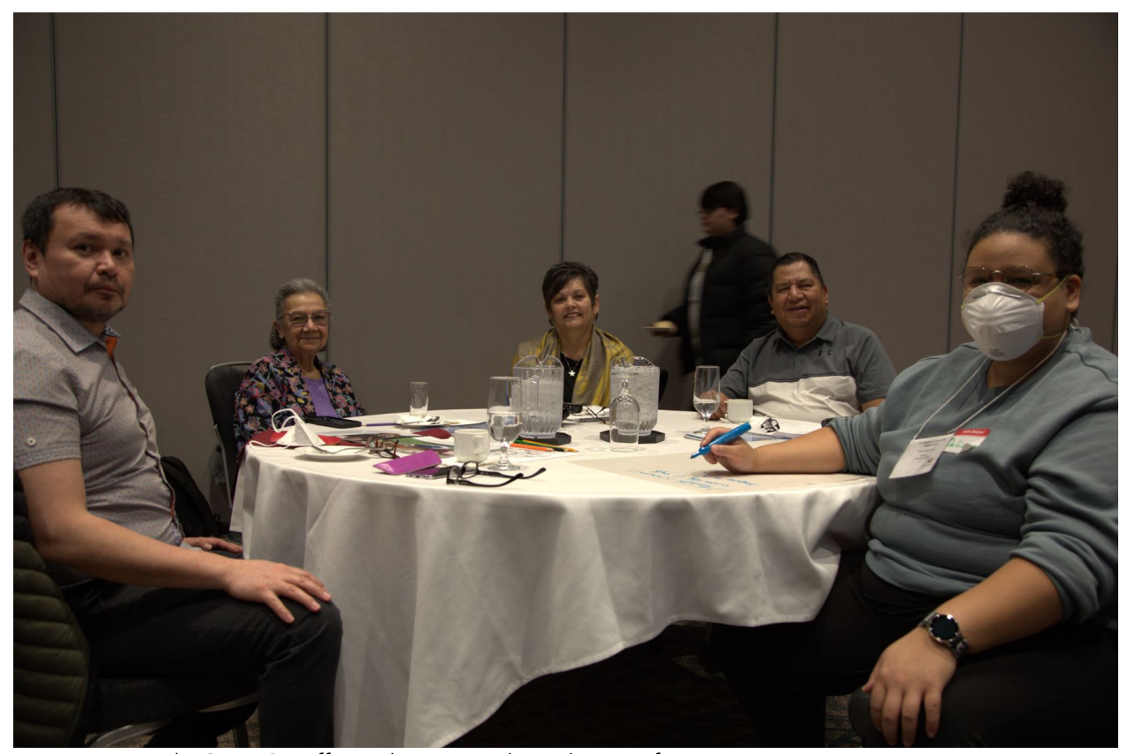
Participants and BCAAFC staff member note-taking during a focus group.

Notes taken by participant in response to Question #13.