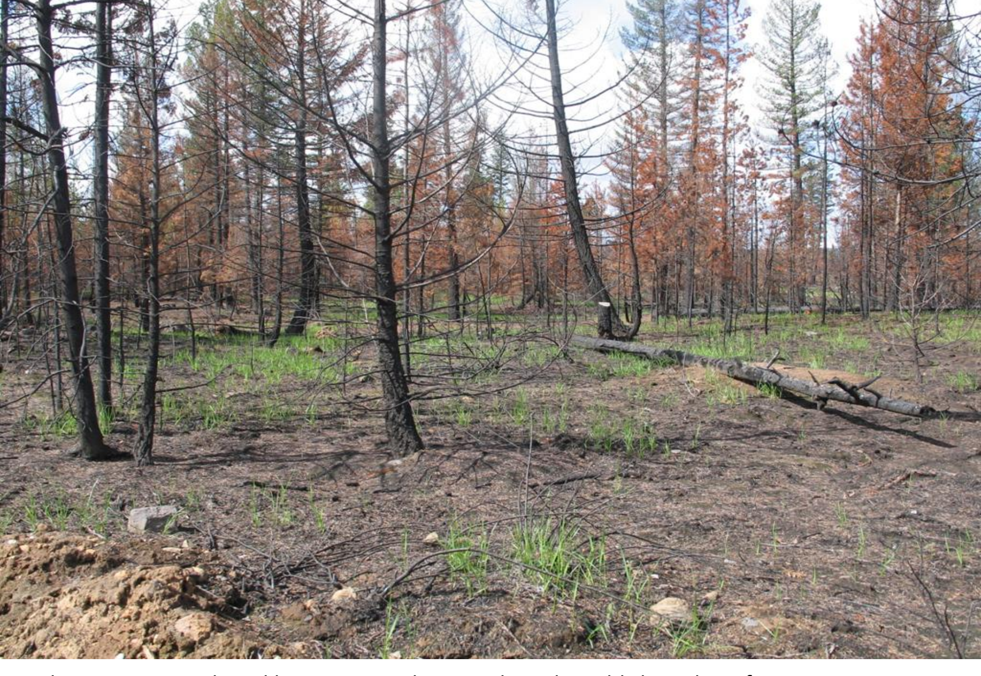
Goal 2: Improve mid- and long-term timber supply and establish resilient forest ecosystems