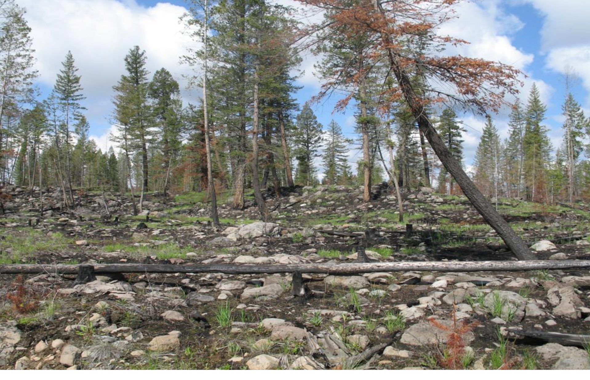
FFT optimally utilizes available funding to reforest and manage productive forest land through the use of best science, and in consideration of all forest values and changing factors.