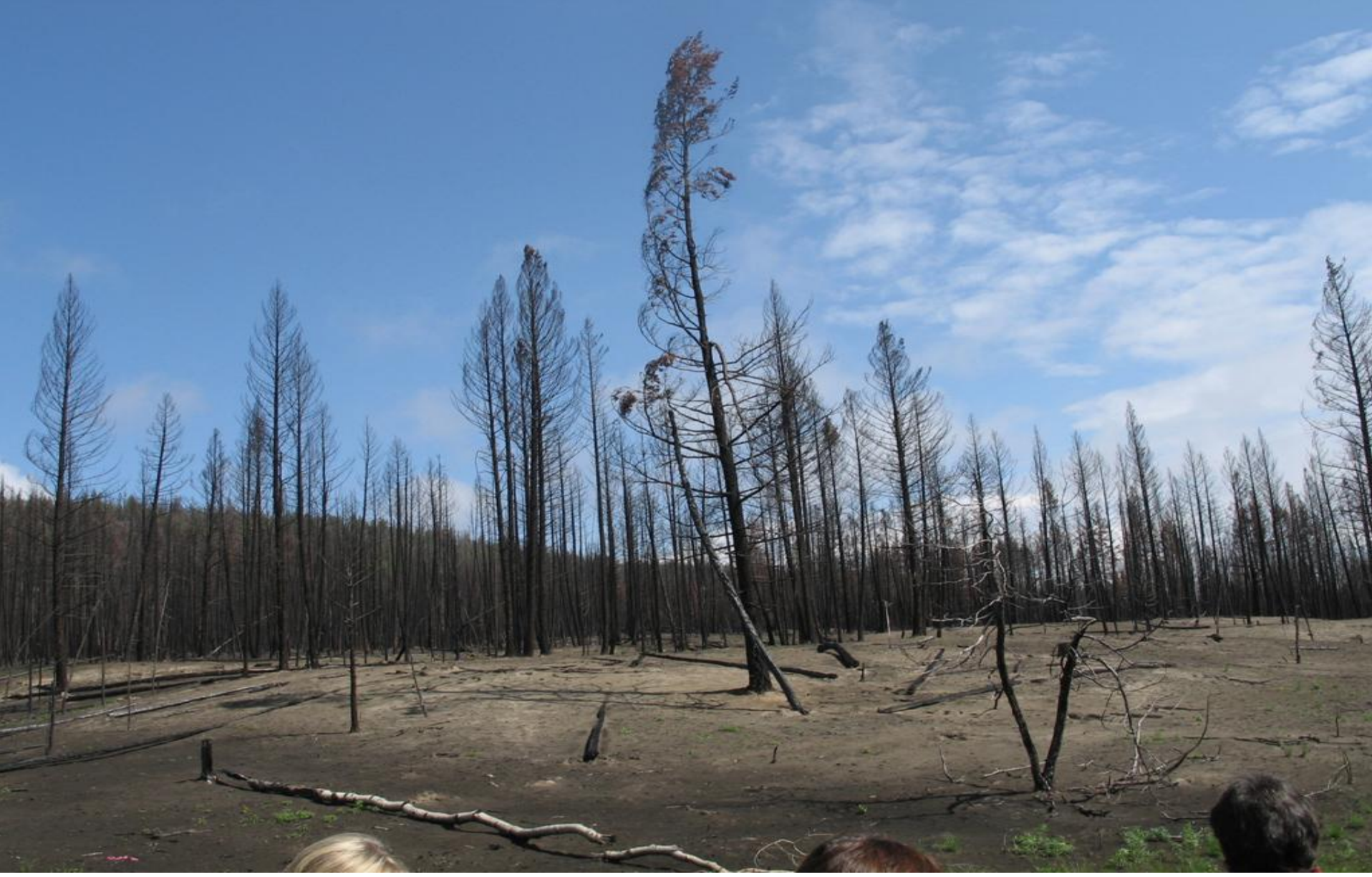
Goal 4: Safety is a fundamental component of all activities and considerations

Goal 5: People-centric approach with active communication, meaningful public engagement opportunities, and knowledgeable staff.