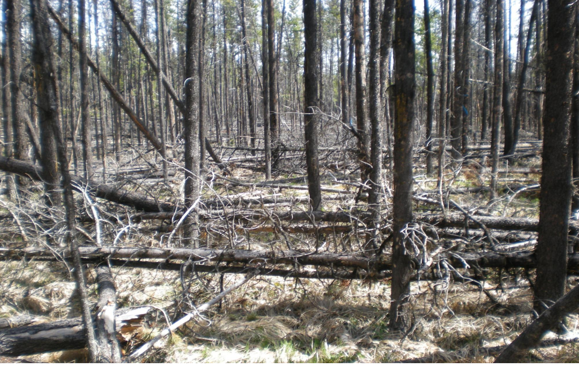
FFT has evolved to assess and treat, where necessary, forested lands that have been denuded or damaged through catastrophic disturbance or government decisions