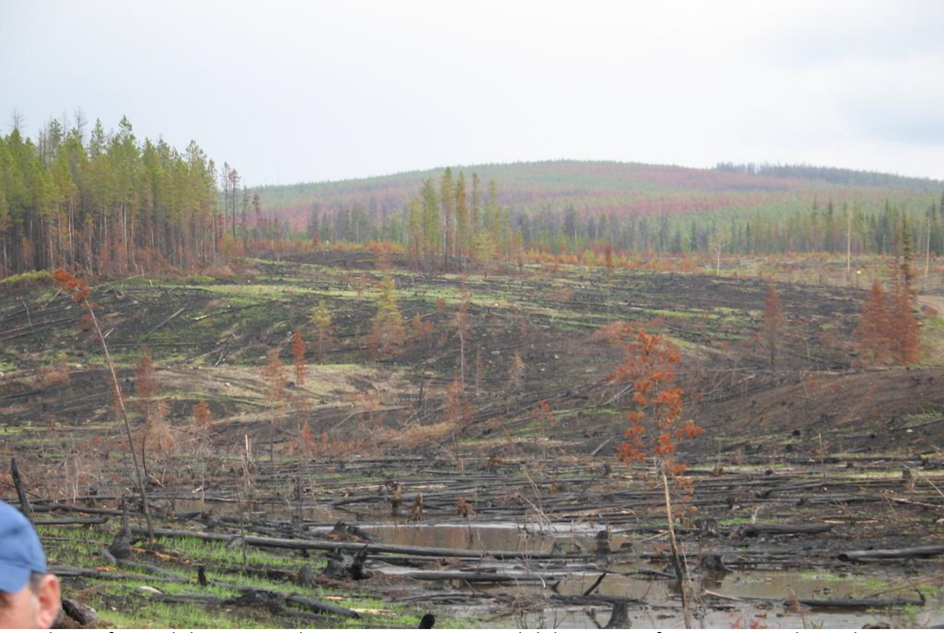
Goal 1: Informed decision-making in investing in, and delivering, reforestation and stand tending activities in an exemplary and transparent manner that improves over time