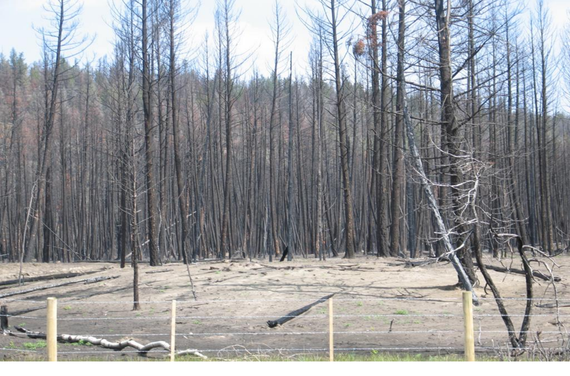
Goal 3: Best return from investments and activities on the forest land base in consideration of timber and non-timber values