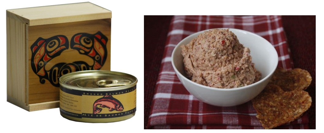
The Smoked Salmon Paté comes in a Haida designed box and makes an easy, yet impressive appetizer.

SeaChange Canadian Gifts is a small, family-run business located on Saltspring Island. The company proud to be Canadian and believes in the importance of community. They donate 5% of profits to local food banks.