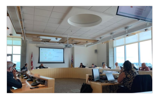
CAOs work together to identify regional priorities for fuel consumption as well as a regional spokesperson to communicate with the media and the public during the 30-minute Regional Coordination Call.

Findings from both the Train-the-Trainer session and the CAO TTX were captured and presented in an After-Action Report (AAR) that identified seven recommendations represented as either best practices or opportunities for improvement.