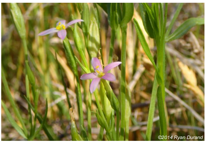
Figure 5 Thin-stemmed, branched plant with 4 to 5 petals per flower