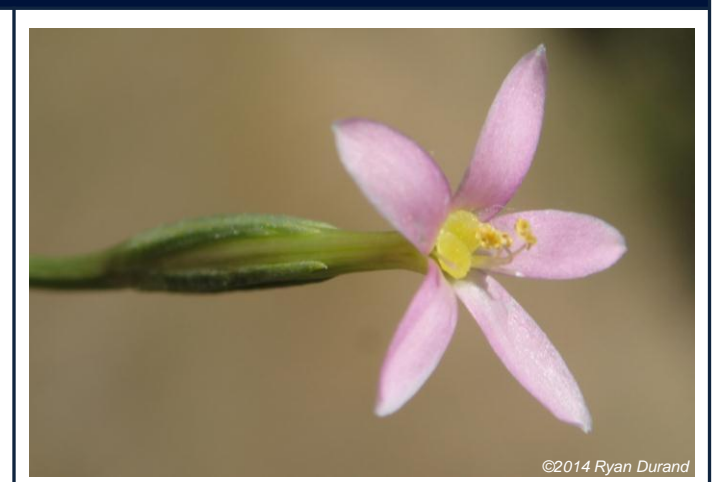
Figure 6 Close-up showing pink petals and bright yellow stamens