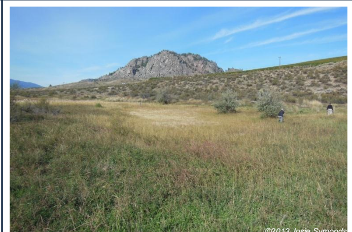
Figure 3 Moist saline meadow habitat near Osoyoos Lake, B.C.

Figure 2 Moist saline meadow habitat near Mahoney Lake, B.C.