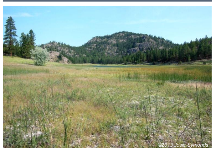
Figure 2 Moist saline meadow habitat near Mahoney Lake, B.C.