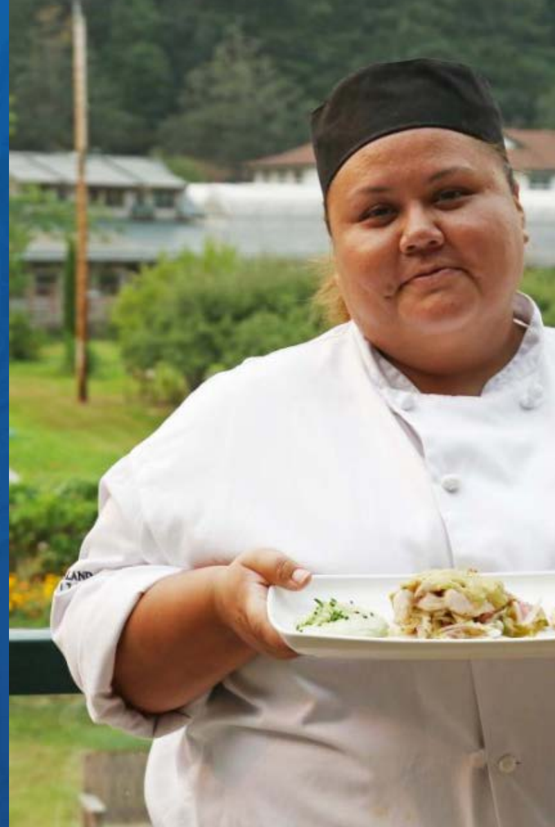
Vancouver Island University: Cowichan-Farm-to-Table Teaching Restaurant