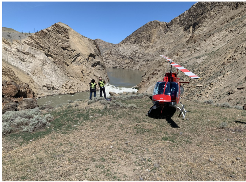
Geotechnical engineers assess the site of the incident.