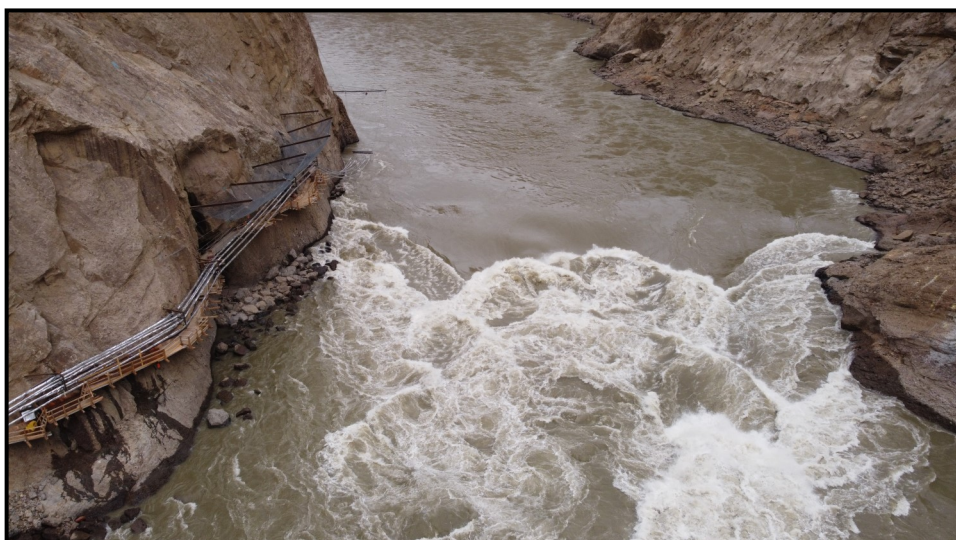
PICTURED: An aerial of the Whooshh Passage Portal™ tubes, the hanger, and the “nature-like” fishway.

The majority of fish arriving at Big Bar this week are sockeye, with the occasional chinook still being observed. Fish continue to migrate past the slide site naturally and to date, over 117,000 salmon have been detected via the ARIS SONAR upstream of the slide at Churn Creek. With natural passage being the primary mode of movement past the slide, Whooshh™ operations are slowing down.