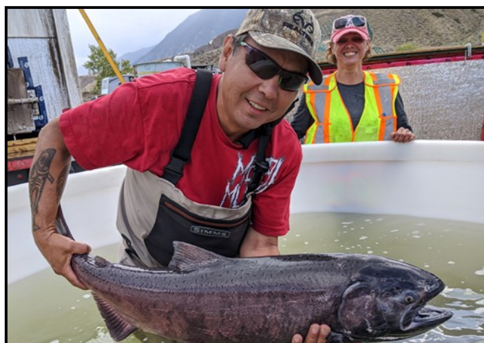
PICTURED: Enhancement efforts at French Bar Creek Fish Holding Facility.

With adult fish collection at the slide site concluded, the team is working to demobilise and winterize the operations at the French Bar Creek Fish Holding Facility. However, work is now underway with the