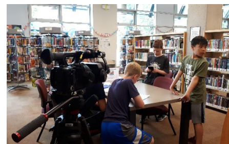
PHOTO: Local students film inside the Lynn Valley Library at Summer Film Camp.

In 2019, there were opportunities for patrons and staff to learn above and beyond our regular staff training and public program offerings. Even though the physical space for StoryLab, our digital creation space, was not yet available, we held programs designed to teach digital literacy skills using equipment that will become available soon.