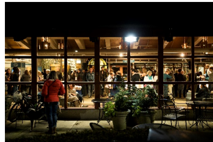
PHOTO: Over 100 people attended the unveiling of the North Shore Authors Collection launch in November 2019.

A project that encompassed all of these was the North Shore Authors Collection, launched in 2019. Working with our library neighbours, North Vancouver City Library and West Vancouver Memorial Library, writers working or living on the North Shore submit copies of their books which are specially catalogued and displayed in all three locations. A celebration of the launch of the program was hosted at West Vancouver Memorial Library in November 2019, in planning and partnership with North Vancouver District and City libraries. This project is based on an initiative of Greater Victoria Public Library, who generously shared their process and experience.