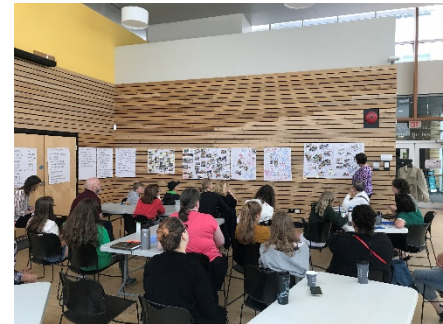
PHOTO: Space planning workshops with community partners, students, and other stakeholders.

In 2019, the Library began working on a long-term, multi-phased project to improve access and flexible use of library spaces. We worked with Urban Arts Architecture to begin looking at how we can reimagine our spaces to better meet community needs.