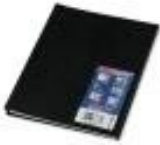
Blueline MiracleBind Note Organizer #7530013030 $10.50