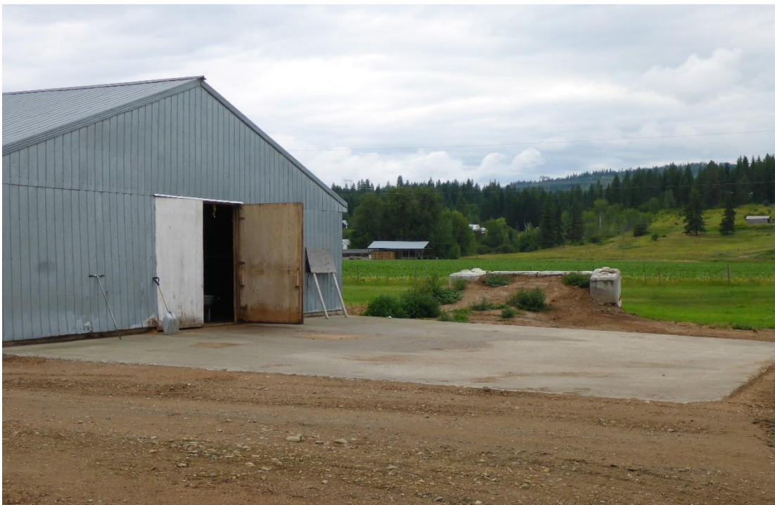
Photograph 4. Concrete pad for temporary manure storage as of June 27, 2016.