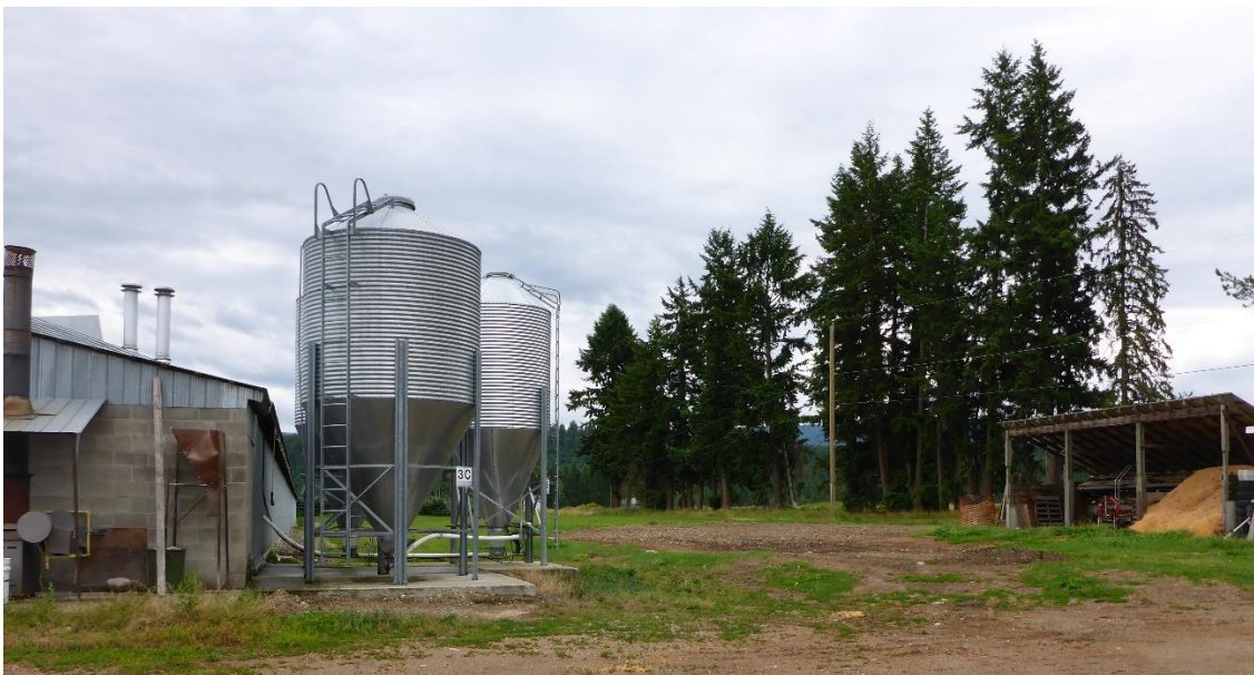
Photograph 1. Site of compost pile which was removed on June 1, 2016. Photo taken June 27, 2016.