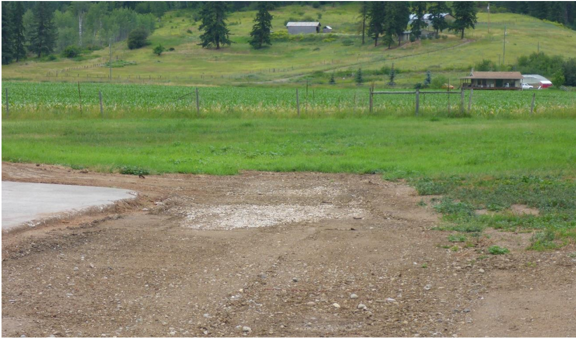
Photograph 3. Area where periodic runoff dissipates into ground (grassed area to north of barns) on June 27, 2016.