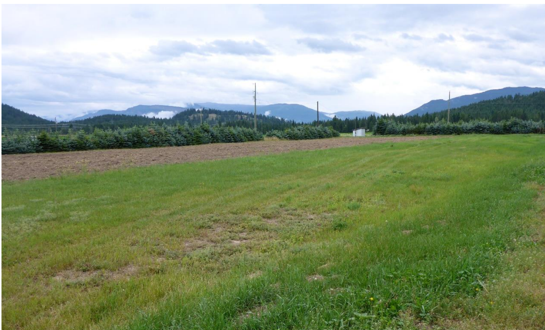
Photograph 2. Trees, fallow land and area of agronomic grasses to north of barns, June 27, 2016.