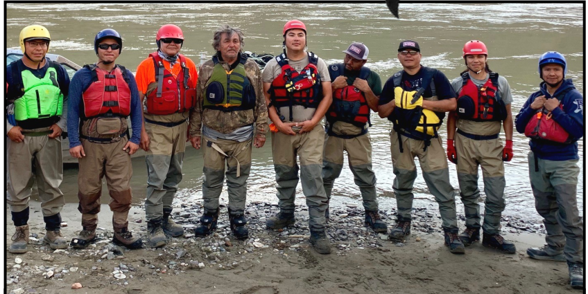
The Skeena seining crew from the Gitxsan Watershed Authority.