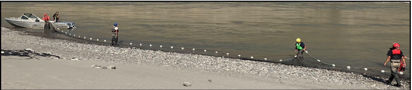
Crews conducting beach seining operations.