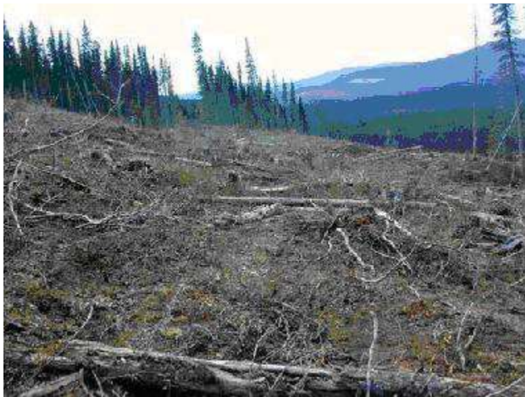
Figure 6: Landscape of the Baptiste watershed following logging operations.