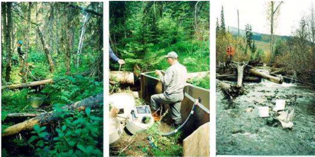
Figure 16: General view of one of the Baptiste study streams (left) and the installation of a weir (middle), together with sampling for invertebrates in the Stuart-Takla drainage (right).