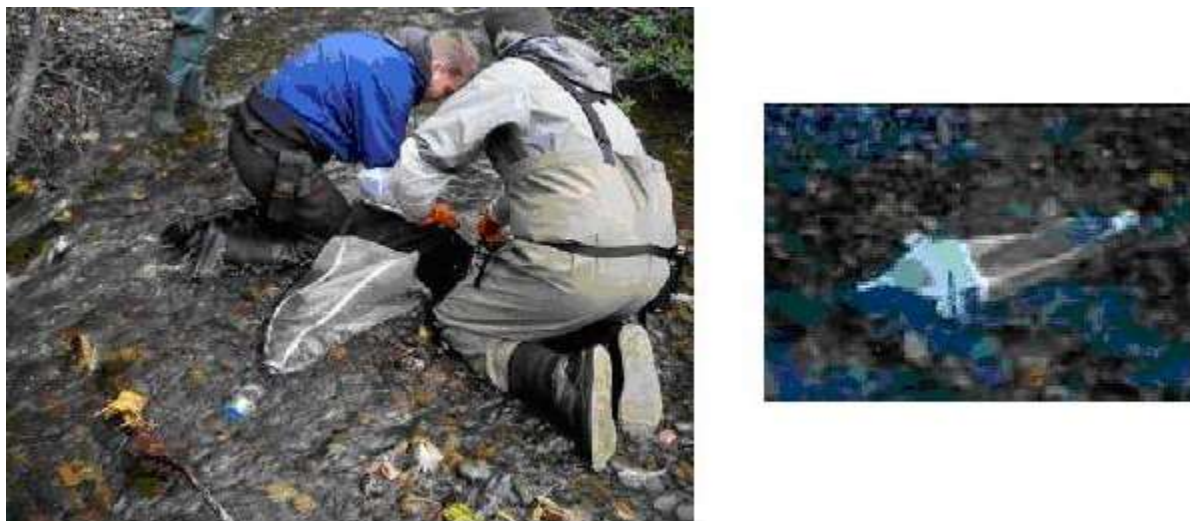
Figure 12: Sampling for invertebrates in the main study streams.