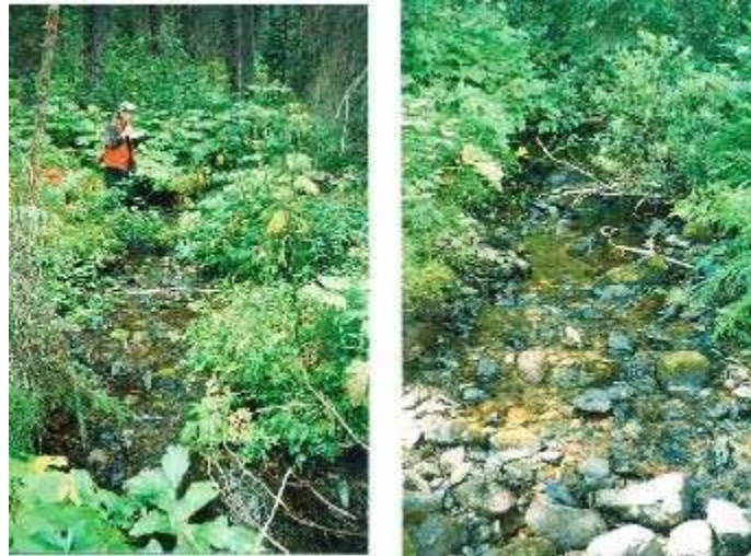
Figure 5: Small streams of the type monitored as part of the Baptiste Creek study.

Headwater studies were located in the upper watersheds of Baptiste and Gluskie Creeks at an elevation of approximately 900 m. Some of the Baptiste streams had rainbow trout in their lower reaches. Variable-retention riparian treatments were prescribed to test the efficacy of current British Columbia legislation that allowed for varying amounts of riparian retention as best management practices for the management of windthrow.