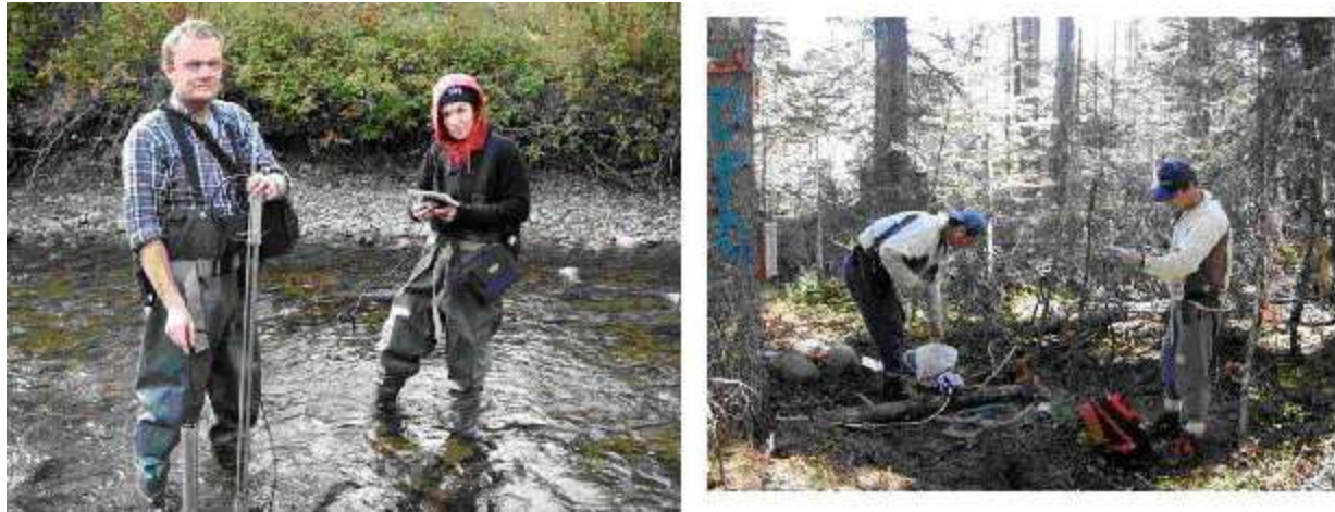
Figure 11: Sampling efforts in the Stuart-Takla study streams.