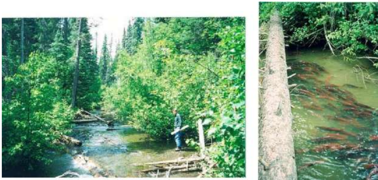
Figure 2: One of the four main study streams of the STFFIP, together with spawning Sockeye salmon.

Due to its multidisciplinary design, the STFFIP involved numerous researchers from various organizations including the Canadian Department of Fisheries and Oceans (lead agency), the B.C. Ministry of Forests and Range, the B.C. Ministry of Environment, Environment Canada, the Canadian Wildlife Service, the University of Northern British Columbia, the University of British Columbia, and Simon Fraser University. Collaboration of a forest industry partner (Canadian Forest Products Limited) was an important component of the study. The early involvement of the local First Nations bands in the STFFIP was also imperative. The study watersheds are part of the traditional territories of the Tl'azt'en Nation. Tl'azt'en band members, as well as members from other First Nations bands of the Carrier Sekani Tribal Council, were involved in many areas of the research.