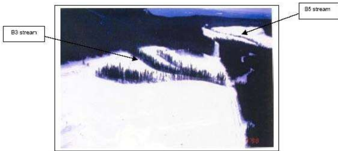
Figure 9: Riparian treatments at the Baptiste study site. The buffer strip in the foreground is the high retention treatment (B3 watershed), the buffer strip in the far cutblock is the low retention treatment (B5 watershed) and the unlogged section between the two cutblocks (upper side of road) is the control watershed (B4 watershed). The photo looks west.

However, to date forest harvesting has been limited to small parts of the upper Gluskie Creek watershed and the lower O'Ne-ell Creek watershed. Economic changes in the forest industry in the mid-1990s and a re-distribution of local logging tenures from CanFor to the small business sector altered logging plans and the economics of harvesting in the watersheds. The Early Stuart sockeye also suffered a recent downturn in abundance that raised sensitivity to any extensive logging in the watersheds of these culturally and economically important sockeye salmon populations.