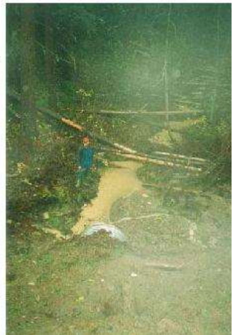
Figure 17: View of the steep, unstable cutbanks left after the removal of a culvert (site is located approximately 200m upstream of the B5 monitoring site), together with sediment from a road crossing being introduced into a stream following a rain storm.