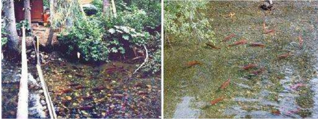
Figure 10: Sampling for bedload transport and spawning sockeye salmon.