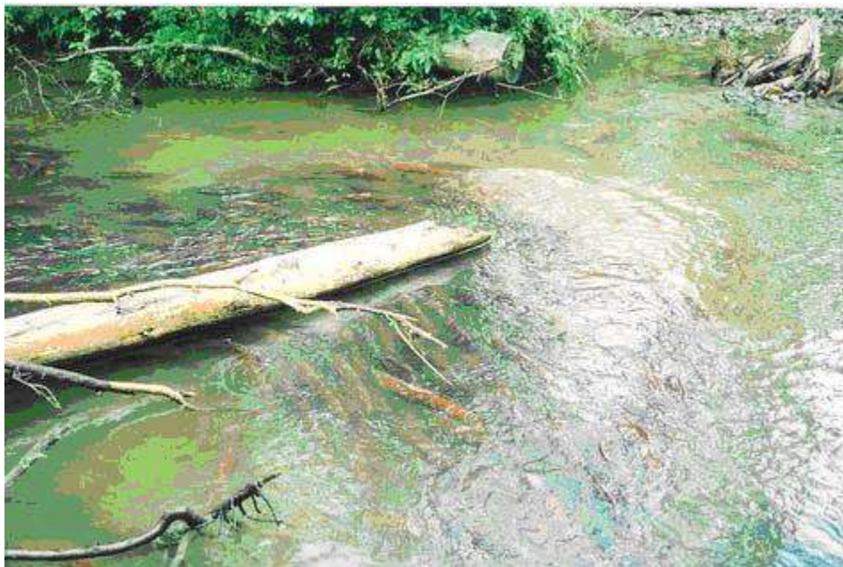
Figure 15: Spawning salmon in Forfar Creek