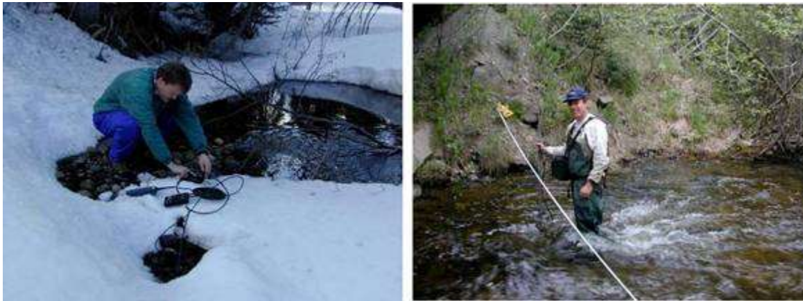
Figure 13: Winter sampling and measuring stream discharge