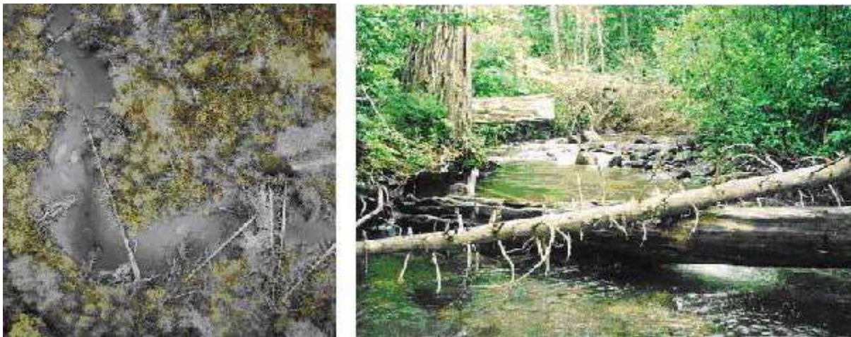
Figure 14: Low-level air photograph of O'Ne-ell Creek taken at an altitude of 100 m (left), together with a close-up view of large woody debris (right).