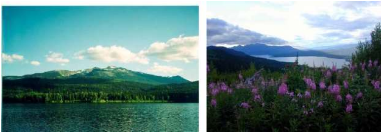
Figure 1: General views of the landscape surrounding the STFFIP watersheds.

The Stuart-Takla Fish-Forestry Interaction Project (STFFIP) was initiated in 1990 from the recognition that our knowledge of the interactions between forest harvesting and aquatic habitats was very limited for the interior of British Columbia. At the time, forestry guidelines and regulations for the protection of fish and fish habitat were largely based on research conducted in coastal watersheds. This research significantly improved both our scientific knowledge and our management capability for mitigating the effects of logging activities on aquatic habitats. However, there are significant differences in physical and biological aspects between coastal and interior watersheds that could affect the functional relationships between forestry and fisheries and their responses to logging disturbances. This uncertainty about the applicability of coastal forest management practices to interior forests was one of the primary driving forces behind the creation of the STFFIP.