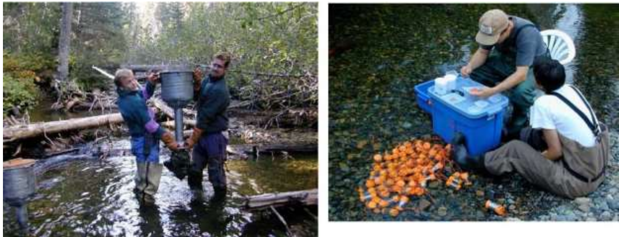
Figure 7: DFO and First Nations personnel conducting sampling in the Stuart-Takla study streams.

For the spawning creeks, 1990-1994 were devoted to collecting baseline and pre-harvest data on natural physical, chemical and biological processes thought to be sensitive to forest harvesting effects. In the original study design, most streamside forest harvesting activities were to have been initiated in the autumn of 1994, with road building and logging in the Gluskie and O'Ne-ell watersheds. Logging was to have begun in the lower portions of each watershed, progressing upstream with time, and using Forfar Creek as a non-harvested control for the duration of the project.