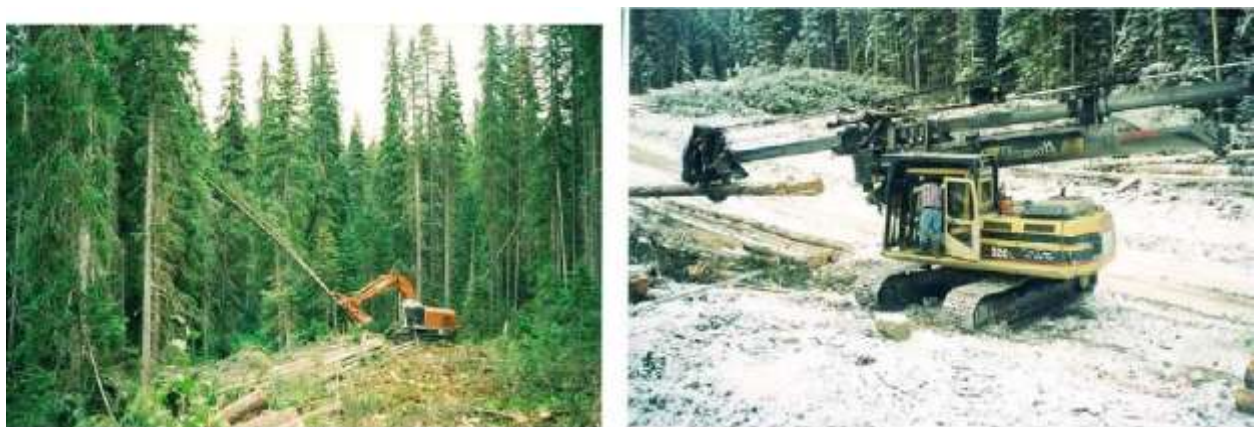
Figure 3: Logging operations in watersheds surrounding the Stuart-Takla area.