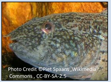
Amur Gobies Rhinogobius similis