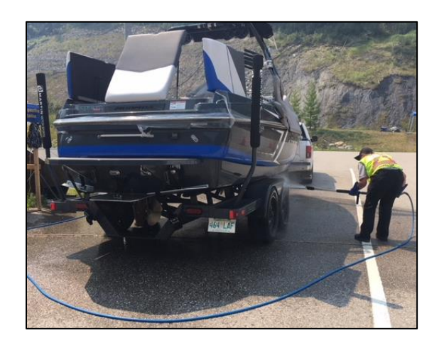
Watercraft being decontaminated (top) and inspected (bottom) at the Golden inspection station.

On August 6<sup>th</sup> the Government of Canada <u>announced</u> funding for research and education to prevent Zebra and Quagga mussel invasion in the Okanagan region. ENV staff will be working closely with DFO staff to discuss this new opportunity and how it will align and complement existing research and education work being done in the Province and its partners.