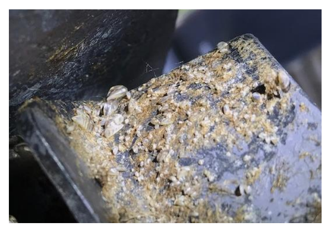
Invasive mussels found on the trim tabs of a cabin cruiser from Michigan. The Surrey inspection crew completed a full decontamination of the watercraft.

Between May 15 and August 17, 355 watercraft were inspected at night (10 p.m. to 5 a.m.) at the Golden inspection station on Hwy 1. Of those, 19 were identified as high risk and two of the mussel fouled watercraft have been intercepted between 10 p.m. and 5 a.m.