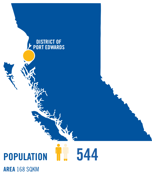
Exhibit 2 - DISTRICT VISUAL FACTS

48. Port Edward is a small community located on BC's north coast, south of Prince Rupert and west of Terrace. The District consists of approximately 168 square kilometres, bordered by the Skeena River, Inverness Passage and mountains north of Highway 16. It is accessible by road and by water.