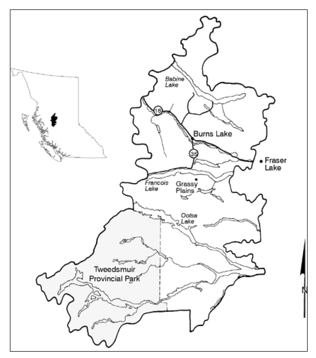
Figure 1. Lakes TSA